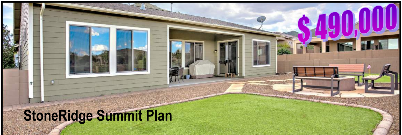
StoneRidge Summit Plan

October 2019 Beautiful Homes & Custom Lots For Sale and For Lease!