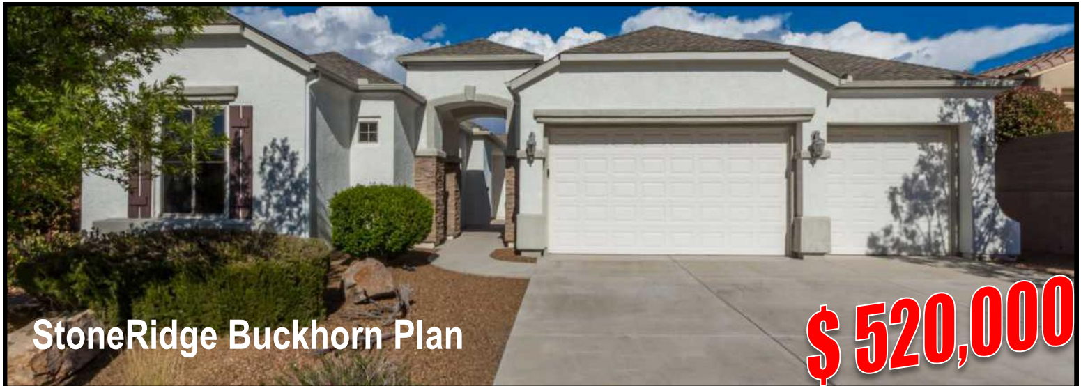
StoneRidge Buckhorn Plan

January 2020 Beautiful Homes & Custom Lots For Sale & For Lease!