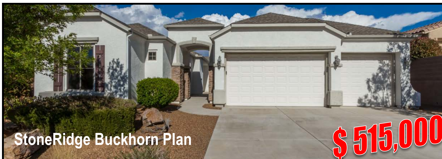
StoneRidge Buckhorn Plan