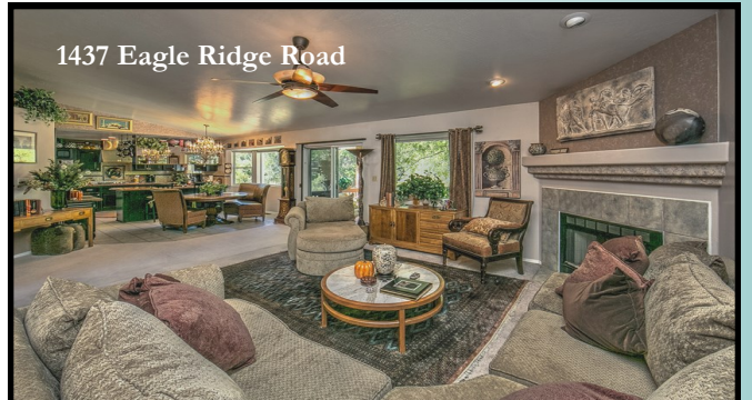
1437 Eagle Ridge Road

Eagle Ridge Beauty with Custom Upgrades Throughout! Gorgeous Granite Kitchen w/Natural Edge, Granite Island/Bar, Stainless Appliances + Refrigerator, Jenn Aire Double Wall Ovens, Gas Cooktop, Full Tiled Backsplash, Upgraded Lighting & Fixtures & Tiled Dining Area w/View Bay Window. Living Room with Large Tiled Fireplace, Art Niche & Lighting, Lighted Ceiling Fan, Vaulted Ceiling & Arch Accents. Designer Custom Accents & Features. Spa Included! 1437 Eagle Ridge Road, Prescott $ 425,000.