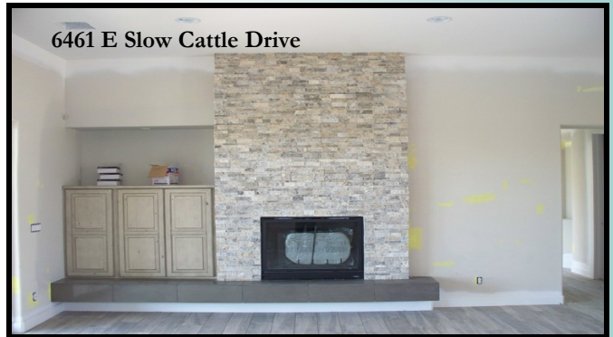
6461 E Slow Cattle Drive

StoneRidge Golf Community Dream Home with Breathtaking Panoramic Views! Serene Golf Course & Mountain Views. Contemporary Braden Homes Designer Estate! 2741 SqFt, 4BD/2.5BA/3GAR + Garage Workshop/Storage Area + Formal Dining Rm + GreatRoom. Custom Designer Upgrades Throughout! Spacious Gourmet Kitchen w/Radianz Quartz Counters & Large Dining Island, Kitchen Aide S/S Appliances, Miele 36" Gas Cook Top, Wall Oven & Microwave. 6461 E Slow Cattle Drive, PV $ 695,000.