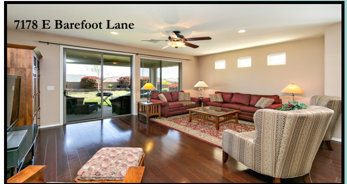
7178 E Barefoot Lane

Beautiful StoneRidge Bungalow "Lupine" Plan with Mountain Views! From the Moment you arrive at the Foyer Entrance with Washington Cherry Wood Floors, High Ceilings & Open Great Room you will Love It! Spacious Kitchen w/Stacked Raised Panel Maple Cabinetry, Corian Counters, Large Dining Island, Upgraded Recessed Lighting w/Dimmers & Black Appliances + Refrigerator. Open Great Room with Slider to Rear Patio. Large Windows & Designer 2 Tone Paint. 7178 E Barefoot Lane. PV $ 325,000.