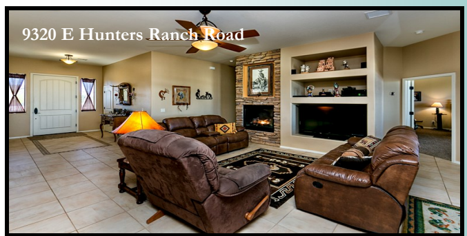
9320 E Hunters Ranch Road

Spacious Living Feels Good Here! 2712 SqFt + AZ Room + 3 Car Garage + Huge RV Garage, Fully Fenced w/Panoramic Mtn. Views on 2 Acres! Tiled Entry Foyer w/Inlay leads to GreatRoom w/Stacked Stone Fireplace, 16" Tile Floors, Lighted Ceiling Fan, Media Niche, Art Niche w/Lighting & Surround Sound Speakers. Open Granite Kitchen w/Large Dining Counter, Beautiful Alder Cabinetry with Crown Molding, Double Wall Oven, Cooktop and Under Counter Lighting. 9320 E Hunters Ranch Road, PV $ 429,000.