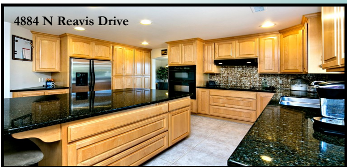
4884 N Reavis Drive

Big, Beautiful Prescott Valley Custom Home with Panoramic Mingus Mountain Views! 3307 SqFt, 5BD/2.5BA/4Car Garage. Spacious Granite Kitchen w/Large Granite Island, Black Appliances, Blond Maple Cabinetry, Breakfast Nook & Tiled Flooring. Formal Living Room & Formal Dining Room w/Large View Windows, Vaulted Ceilings, Bow Windows w/Arched Accents. Huge Family Game Room w/Vaulted Ceilings, Recessed Lighting and Cozy Stone Fireplace w/Hearth and Mantle. 4884 N Reavis Dr, PV $ 360,000.