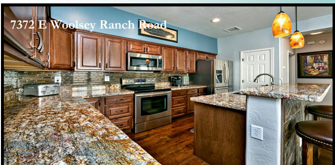
7372 E Woolsey Ranch Road

Amazing StoneRidge Everything is Gorgeous Remodeled Primrose Plan! New Carpet, New Tile, New Hardwood Floors, New 4" Baseboards, New 2-Tone Paint, New Exterior Paint, New Blinds on Every Window, New Granite Counters w/Glass Tiled Backsplash, New Custom Cabinetry, New S/S Appliances, Surround Sound, New Convection Oven, New Pendant Lighting Over Kitchen Island, New Chandelier, New Lighted Ceiling Fans Throughout and so much more! 7273 E Woolsey Ranch Road, PV $ 349,900.