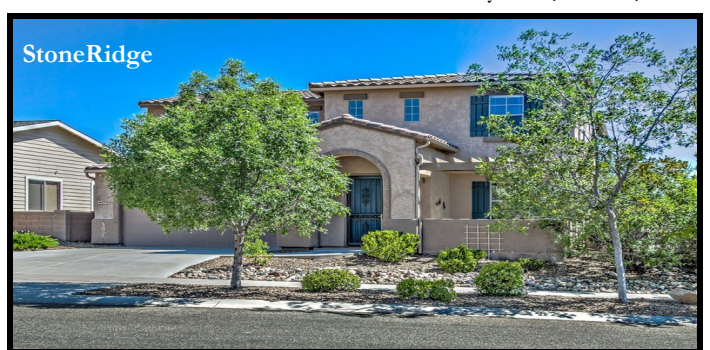
Move In Ready Spanish StoneRidge "Acacia" Plan! Nice Corner Lot w/Mountain Views & Designer Upgrades! Great Room w/Tiled Corner Fireplace w/Art/TV Niche and Media Niche. Don't Miss This One! 7754 E Bravo Ln., PV $329,500.