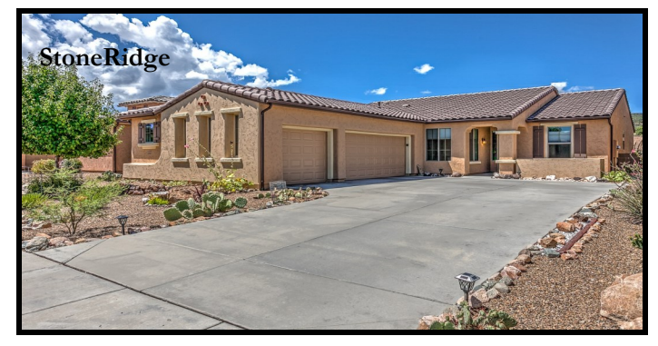
StoneRidge Highly Desired Move In Ready Spanish Chaparral Plan with Large 3 Car Garage. Open Concept Kitchen w/Granite Counters, Granite Island, Dining Bar & Upgraded Beechwood Cabinetry. Great Location! 1080 N Rigo Ranch Rd, PV $ 300,000.