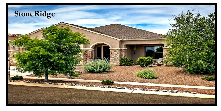
Rare & Beautiful StoneRidge "Weaver" Plan with Golf & Mountain Views! Gorgeous Great Room w/Floor to Ceiling Stacked Rock Walls, Pine Pole Accents, Cozy Stone Fireplace and so much more! 7591 E Traders Trail, PV $400,000.