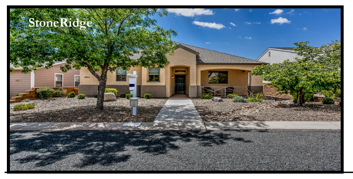
StoneRidge Monterra Plan, Upgraded & Move In Ready! 1536 SqFt, 3BD/2BA/2GAR, Beautiful Granite Kitchen & Granite Island, Brand New Stainless Appliances + Brand New S/S Refrigerator & Upgraded Cabinetry. 7072 E Lynx Wagon Rd., PV $ 245,000.