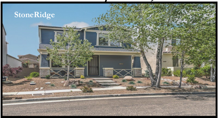
Amazing StoneRidge Everything is Gorgeous Remodeled "Primrose" Plan! New Carpet, New Tile, New Hardwood Floors, New 4" Baseboards, New 2 Tone Interior Paint, New Exterior Paint & New Granite Counters. 7273 E Woolsey Ranch, PV $ 334,000.

September, 2015 Beautiful Homes For Sale!