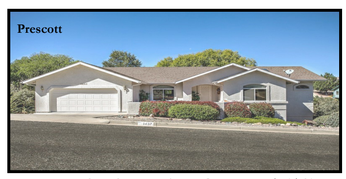
Enjoy your Morning Cup of Coffee on the Spacious Deck of this 4BR/3BA/2GAR, 3553 SqFt. Home in Prescott's Premier Eagle Ridge Community. Entrance Leads to a Large, Open Great Room w/Cozy Tiled Fireplace. 1437 Eagle Ridge, Prescott $425,000