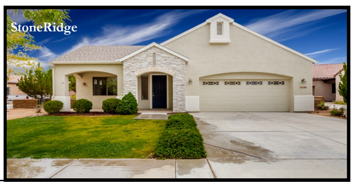
Nice Updated English StoneRidge Glassford Plan on Quiet Cul-De-Sac! 2789 SqFt., 4BD/3BA/2GAR. Beautiful Brand New Wood Floors & Carpet! Open Concept Granite Kitchen & Granite Island w/Upgraded Cabinetry. 7161 E Slow Draw Dr., PV $ 350.000.