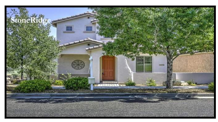
StoneRidge 2 Story Spanish Primrose Plan with Golf, Park & Mountain Views! 2218 SqFt., 4BD/2.5BA/2GAR. Good StoneRidge Location Near Activity Clubhouse w/Fitness Center, Pools, Tennis and Spa. Nice Corner Location. 7182 E Night Watch Way, PV $294.000.