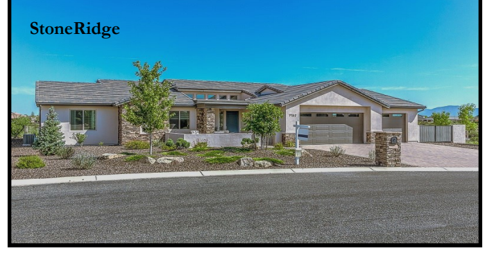
StoneRidge Panoramic Golf Course Views Custom Home with Designer Upgrades Everywhere! 3BD/2.5BA/4GAR, Beautiful Quartz Gourmet Kitchen with Huge Island, Stainless Appliances and so much more. 7762 E Blacksmith Circle, PV $ 649,000.