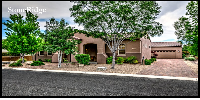
Rare & Spacious StoneRidge "Bradshaw" Plan with Upgrades Throughout on Nice Corner Location! 2585 SqFt., 4BD/3BA/2GAR + Formal Living Rm+ Family Rm + Private Outside Entrance Bedroom Casita. 7180 E Slow Draw Dr., PV $ 365,000.