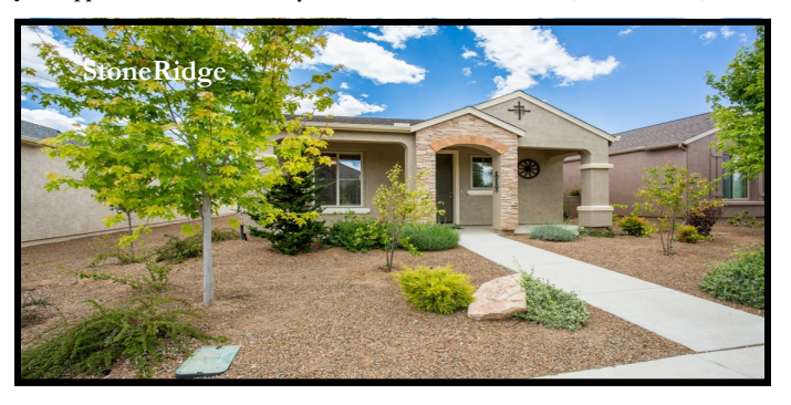
Rare StoneRidge Golf Community Rosemary Plan! 1508 SqFt., Single Level Home with Beautiful Hand Scraped Tongue & Groove Wood Flooring Thoughout, 2BD + Den + Formal Dining Room/2BA/2GAR. 7259 E Night Watch Way, PV $ 235,000.