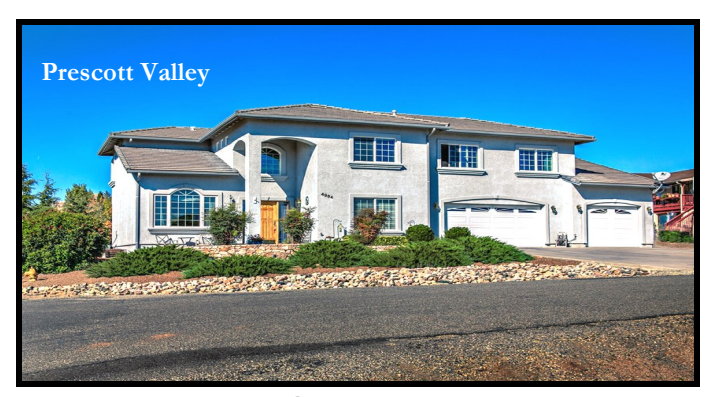
Big and Beautiful Prescott Valley Custom Home with Panoramic Mingus Mountain Views! 3307 SqFt, 5BD/2.5BA/4Car Garage. Spacious Granite Kitchen with Large Granite Island and Black Appliances. 4884 N Reavis Drive, PV $348,000.