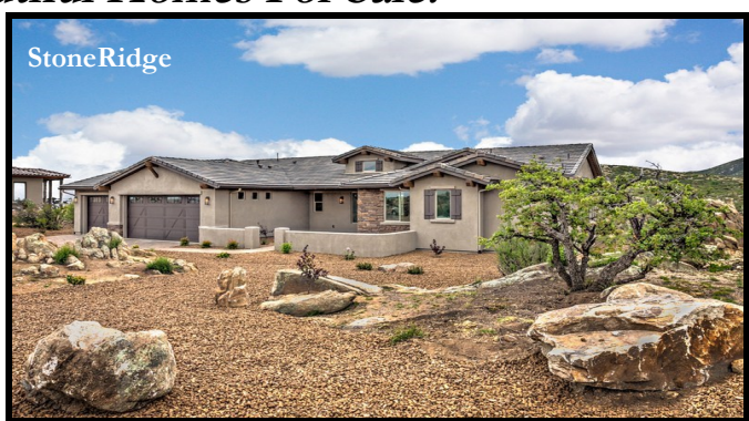
StoneRidge Golf Community Dream Home with Breathtaking Panoramic Views! Serene Golf Course & Mountain Views! 4BD/2.5BA/3GAR, 2741 SqFt. Spacious Gourmet Kitchen w/Quartz Counters. 6461 E Slow Cattle Dr., PV $649,500.