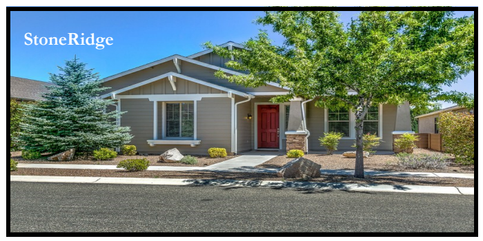
Stoneridge Bungalow Laguna Plan w/Designer Upgrades Throughout! Beautiful Open Concept Granite Kitchen & Granite Island w/Jenn Aire Stainless Appliances + Jenn Appliances. Move In Ready! 1017 N Cloud Cliff Pass, PV $300,000.