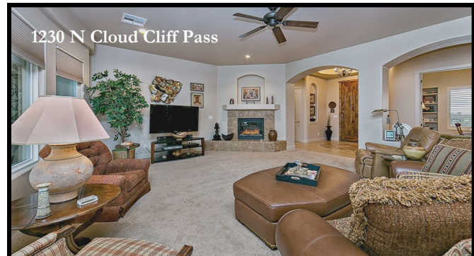
Beautiful StoneRidge Custom Dream Home! Aspen Ridge Plan, 3030 Sq.Ft., Single Level Luxury Home, Panoramic Golf and Mountain Views, Backs to 47+ Acres of Natural Common Space of Lookout Mountain, 4 Bedrooms, 2.5 Bath, 3+ Oversized Garage w/Epoxy Floor, Gorgeous Granite Kitchen Counters w/Tiled Backsplash, Granite Dining Island, Closet Pantry, Stacked Alder Cabinetry, Andersen Windows and Doors, Corner Fireplace, Bow Windows and so much more! 1230 N Cloud Cliff Pass, PV $ 635,000.