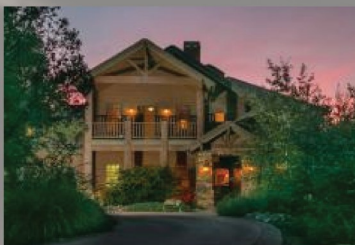
9880 N. Clear Fork Rd. American Ranch MLS# 983485 $1,250,000