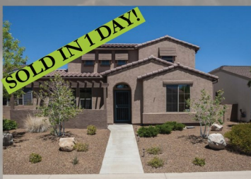
1633 N Thimble Ln MLS# 991089 $300,000