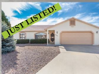
9021 N Bighorn Dr. PV MLS# 991150 $200,000