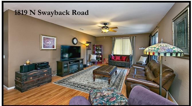
StoneRidge English Monterra Plan, 1536 SqFt, 2BD + Double Door Den (Possible 3rd Bedroom), 2BA/2GAR, Large Living Room w/Lighted Ceiling Fan, Wood Laminate Floor & Slider to Rear Covered Patio. Kitchen w/Corian Counters, Island, Dining Area, Pantry + Refrigerator. Master BD/BA w/Large Oval Jetted Tub, Glass Enclosed Shower, Oak Cabinetry, Dual Sinks & Walk In Closet. Inside Laundry Room with Washer and Dryer. 4' Garage Extension. EZ Care Yards. 1819 N Swayback Road, PV $ 235,000.