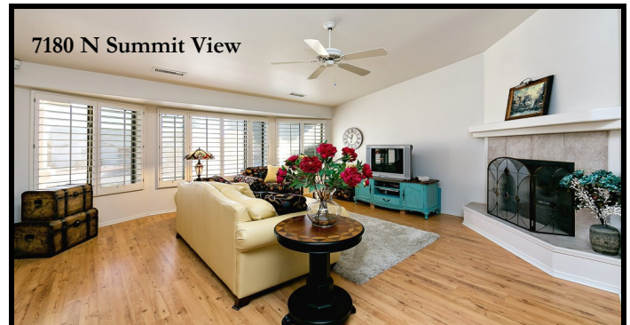
7180 N Summit View

Viewpoint Home For Sale! Well Kept, Single Level 3BD/2BA/3 Car Garage, 1608 SqFt on Spacious Pro-Landscaped .25 Acre Lot. Open GreatRoom w/Cozy Tiled Fireplace w/Hearth and Mantle, Custom Plantation Blinds, Big Bow Window w/Sun Screens, Ceiling Fan, Vaulted Ceiling and Newer Laminate Flooring. Kitchen w/Oak Cabinetry, White Appliances + Refrigerator, Laminate Counter w/Shaved Edge + Dining Counter, Closet Pantry, Recessed Lighting and Tiled Flooring. 7180 N Summit View Dr., PV $ 245,000.