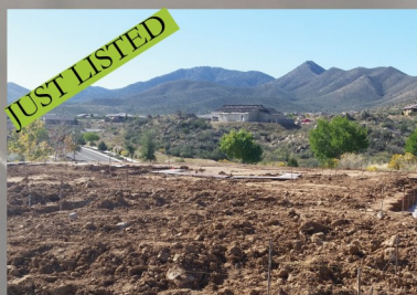
7791 E. Bravo Ln. Custom home on corner lot with views! Completion Date January 2016