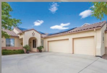
7591 E Traders Trail StoneRidge $400,000