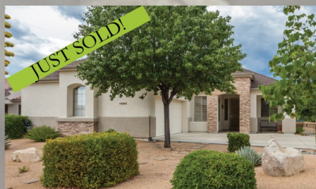
7044 N Lynx Wagon StoneRidge $264,000