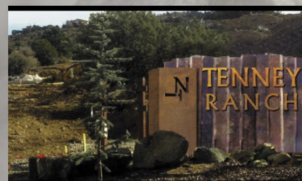
19 luxurious custom homes in Tenney Ranch! Starting in the mid $500,000's. Close to downtown Prescott and Acker Park with spectacular views!