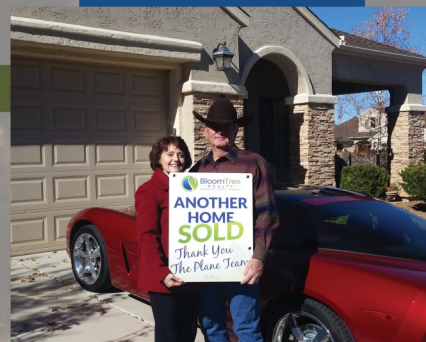
New Stone Ridge Neighbor