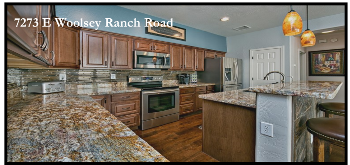
7273 E Woolsey Ranch Road

Amazing StoneRidge Everything is Gorgeous Remodeled Primrose Plan! New Carpet, New Tile, New Hardwood Floors, New 2 Tone Interior Paint, New Exterior Paint, New Blinds on Every Window, New Granite Counters w/Glass Tiled Backsplash, New Custom Cabinetry, New S/S Appliances, Surround Sound, New Convection Oven, New Pendant Lighting over Kitchen Island, New Chandelier, New Lighted Ceiling Fans Throughout, New Toilets, New Sinks and so much more! 7273 E Woolsey Ranch Rd, PV $ 300,000.