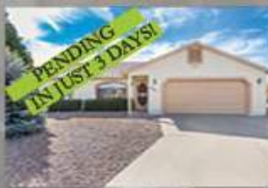
9021 N Bighorn Dr. PV MLS# 991150 $200,000