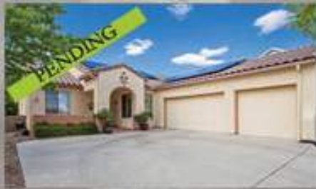
1728 N. Colton Dr StoneRidge $312,000