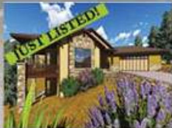
789 Tenney Lane Tenney Ranch $619,000 MLS # 991543