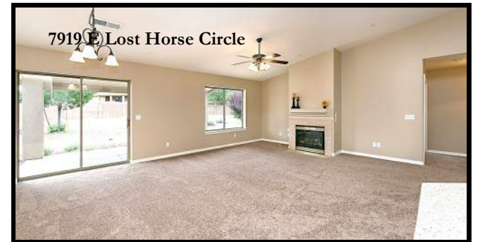
7919 E Lost Horse Circle

For Lease! Beautiful Upgraded Pronghorn Ranch Custom Home, 2217 SqFt, 4BD/2.5BA/3GAR + Formal Living/Dining Room + Great Room. Brand New Interior 2 Tone Paint, New Carpet, New Gas Stove, High Vaulted Ceilings, Big Gated Rear Yard with Covered Patio. .38 Acre Cul-De-Sac Lot & Huge Driveway. Open Kitchen with Corian Counters, Island and Bisque Appliances including Refrigerator. Great Room with Vaulted Ceilings & Cozy Tiled Fireplace. 7919 Lost Horse Circle, PV $1,700 per mo.