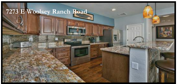
7273 E Woolsey Ranch Road

For Lease! StoneRidge Gorgeous Remodeled Primrose Plan! New Carpet, New Tile, New Hardwood Floors, New 2 Tone Interior Paint, New Exterior Paint, New Blinds on Every Window, New Granite Counters w/Glass Tiled Backsplash, New Custom Cabinetry, New S/S Appliances, Surround Sound, New Convection Oven, New Pendant Lighting over Kitchen Island, New Chandelier, New Lighted Ceiling Fans Throughout, New Toilets, New Sinks and so much more! 7273 E Woolsey Ranch Rd, PV $1,750 per mo.