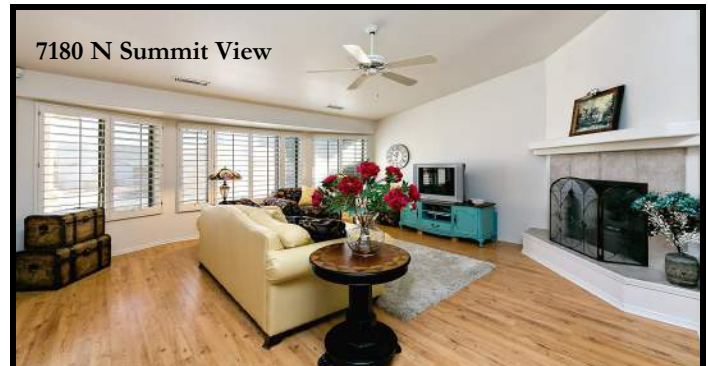
7180 N Summit View

Viewpoint Home For Sale! Well Kept, Single Level 3BD/2BA/3 Car Garage, 1608 SqFt on Spacious Pro-Landscaped .25 Acre Lot. Open GreatRoom w/Cozy Tiled Fireplace w/Hearth and Mantle, Custom Plantation Blinds, Big Bow Window w/Sun Screens, Ceiling Fan, Vaulted Ceiling and Newer Laminate Flooring. Kitchen w/Oak Cabinetry, White Appliances + Refrigerator, Laminate Counter w/Shaved Edge + Dining Counter, Closet Pantry, Recessed Lighting and Tiled Flooring. 7180 N Summit View Dr., PV $245,000.