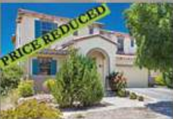
7183 Grass Land Stoneridge $310,000 MLS # 991703