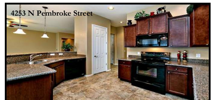
4253 N Pembroke Street

For Lease! Brand New Beautiful Granville Home with Panoramic Mingus Mountain Views! 3BD/2BA/2.5 Car Garage, 1661 SqFt. Tiled Foyer Entrance leads to Spacious Great Room with Cozy Corner Fireplace with Blower, Open Concept Granite Kitchen w/Pendant Lighting, Dining Counter Island, Closet Pantry, Recessed Lighting, Beautiful Staggered Maple Nutmeg Cabinetry, Black Appliances including Refrigerator and Convection Oven. No Pets Please. 4253 N Pembroke Street, PV $1,650 per mo.