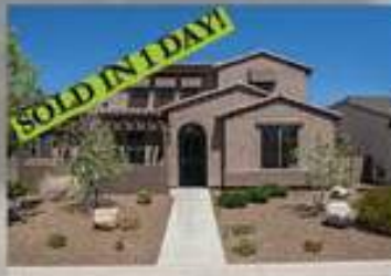
1633 N Thimble Ln MLS# 991089 $300,000