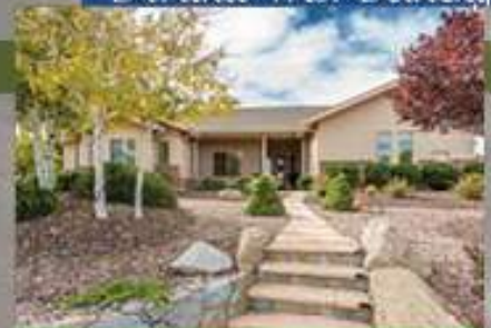
1353 Winfield Circle