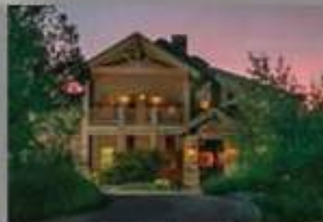
9880 N. Clear Fork Rd. American Ranch MLS# 983485 $1,250,000