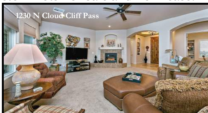
1230 N Cloud Cliff Pass

Beautiful StoneRidge Custom Dream Home! Aspen Ridge Plan, 3030 Sq.Ft., Single Level Luxury Home, Panoramic Golf and Mountain Views, Backs to 47+ Acres of Natural Common Space of Lookout Mountain, 4 Bedrooms, 2.5 Bath, 3+ Oversized Garage w/Epoxy Floor, Gorgeous Granite Kitchen Counters w/Tiled Backsplash, Granite Dining Island, Closet Pantry, Stacked Alder Cabinetry, Andersen Windows and Doors, Corner Fireplace, Bow Windows and so much more! 1230 N Cloud Cliff Pass, PV $ 624,000.