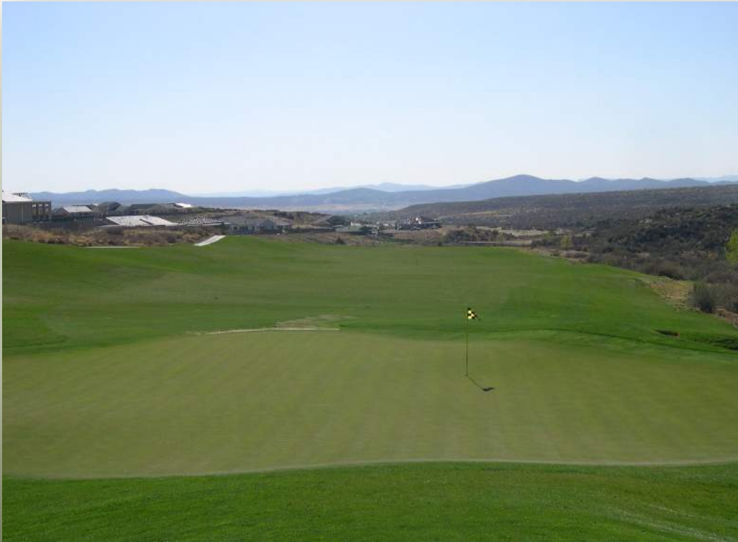
Photo is of 4th hole and is similar to the views from these lots