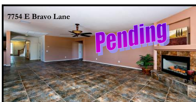
7754 E Bravo Lane

Move In Ready Spanish StoneRidge Acacia Plan! Nice Corner Lot w/ Mountain Views & Designer Upgrades! Tiled Entrance Foyer leads past Double Door Den/Possible 5th Bedroom to Spacious GreatRoom w/Tiled Corner Fireplace w/Art/TV Niche + Media Niche. Tiled Kitchen Counters + Dining Bar, Arched Entry & Dining Area. Main Level Master Bedroom w/Upgraded Tile Flooring, Oval Garden Tub, Glass Enclosed Shower and Walk In Closet. 7754 E Bravo Lane, PV $329,500.