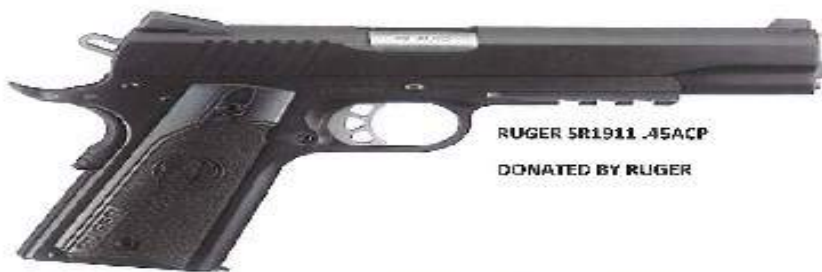
RUGER SR1911 .45ACP DONATED BY RUGER

3RD PRIZE WINNER WILL GET THE TO CHOOSE FROM WHAT IS LEFT