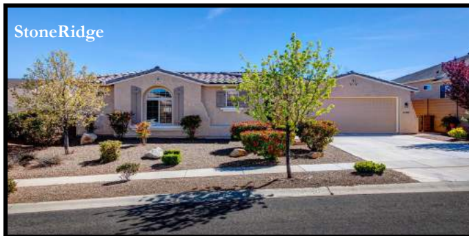
Single Level StoneRidge Summit Plan! 2550 SqFt, 3BD + Bonnu Rm/2.5BA/3Car Garage + Formal Dining/Den. Open Granite Kitchen w/Granite Dining Island, Tiled Informal Dining Area and Double Door Pantry. 7503 E Traders Trail PV $ 400,000.