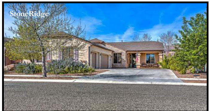
Highly Desired StoneRidge Chapparral Plan, 1852 SqFt, 3BD/2BA/3Car Garage. Gorgeous Open Concept Granite Kitchen w/Maple Stacked Cabinetry, New Stainless Appliances & Granite Dining Counter. 1100 N Rigo Ranch Road, PV $ 320,000.