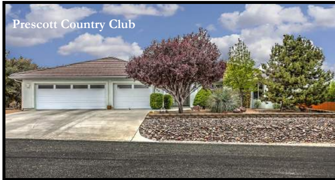
Prescott Country Club

Bright & Spacious Custom Home with Designer Upgrades Throughout! 3,549 SqFt, 4BD/3.5BA/3Car Garage + RV Parking. Open Living Room w/Contemporary Tiled Stone & Granite Cozy Fireplace. Nice Jr Master Suite. 596 N Mohave Trl. PV $ 375,000.