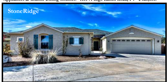
StoneRidge Summit Plan, 2550 SqFt, Good Cul-De-Sac Location w/Beautiful Front Views! 3BD/2.5BA/3Car Garage + Great Rm+ Formal Dining Rm + Bonus Rm. Granite Kitchen w/Large Dining Island. Great Room w/Fireplace. 7355 E Weaver Way, PV $ 385,000.