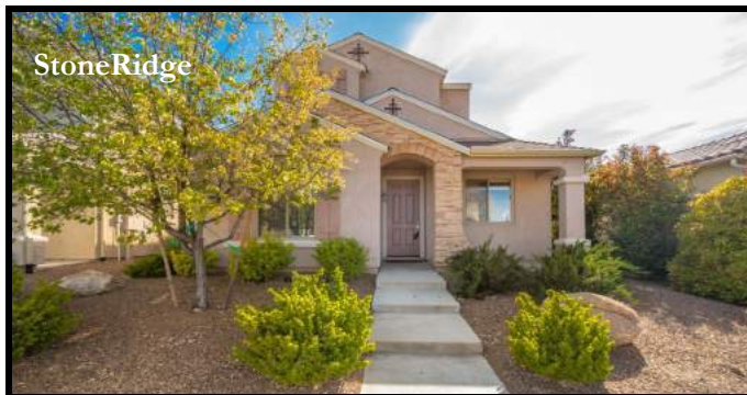
StoneRidge Goldenrod Plan, 1966 SqFt, 4BD/3BA/2GAR, 2 Stories, Sold Furnished, Great 2nd Home w/Nice Upgrades! Spacious Living Rm w/Large Windows & Slider to Rear Yard. Kitchen w/Oak Cabinetry & Recessed Lighting. 7233 E Woolsey Ranch, PV $294,900