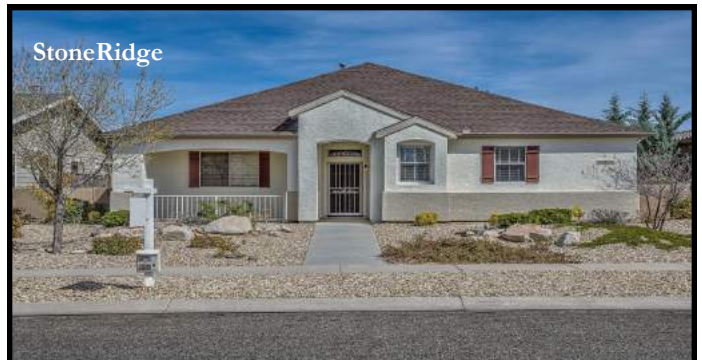
Popular StoneRidge Monterra Plan, Upgraded Throughout! 1536 SqFt, 3BD/2BA/2Car Garage. Beautiful NEW Granite Kitchen Counters w/Beautiful New Upgraded Stainless Appliances + Refrig. 7715 Crooked Creek Trail, PV $ 260,000.