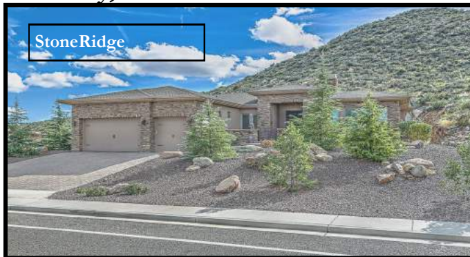
Beautiful StoneRidge Custom Dream Home! Aspen Ridge Plan, 3030 SqFt., Single Level Luxury Home, Panoramic Golf & Mtn Views, Backs to 47+ Acres of Natural Common Space of Lookout Mountain. 4BR/2.5BA/3+GAR. 1230 Cloud Cliff Pass PV $ 600,000.

May, 2016 Beautiful Homes & Custom Lots For Sale and For Lease!