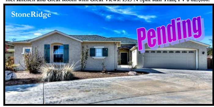
StoneRidge Summit Plan, 2550 SqFt, Good Cul-De-Sac Location w/Beautiful Front Views! 3BD/2.5BA/3Car Garage + Great Rm+ Formal Dining Rm + Bonus Rm. Granite Kitchen w/Large Dining Island. Great Room w/Fireplace. 7355 E Weaver Way, PV $ 385,000.