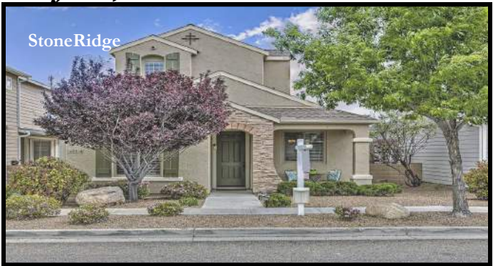
Charming StoneRidge Goldenrod Plan, 1966 SqFt, 4BD/2.75BA/2Car Garage. Nice Location Near Park + Recent Upgrades! Granite Kitchen w/Stainless Appliances + Refrig., Tiled Floor & Beechwood Cabinetry. 7218 E Night Watch Way, PV $ 295,000.