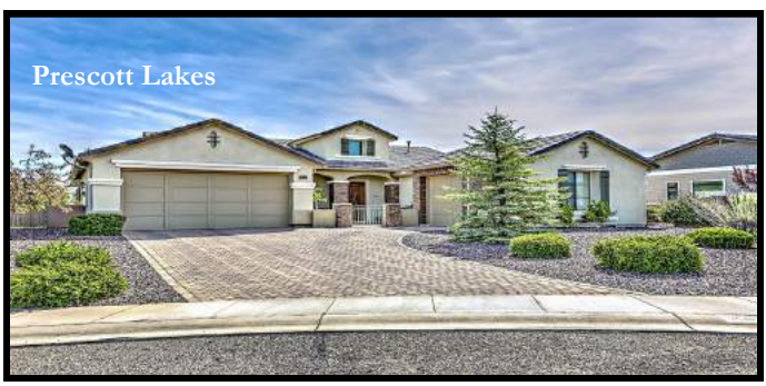
Location, Location! The BEST Prescott Lakes Golf & Lake Views in All of Prescott! Great Cul-de-Sac Location, 6BD/3BA/4Car Garage, 3289 SqFt, Great Room w/View Sliding Glass Doors and Cozy Stone Fireplace. 2505 Merion Court, Prescott $ 629,000.