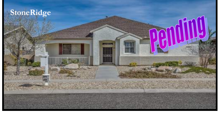
Popular StoneRidge Monterra Plan, Upgraded Throughout! 1536 SqFt, 3BD/2BA/2Car Garage. Beautiful NEW Granite Kitchen Counters w/Beautiful New Upgraded Stainless Appliances + Refrig. 7715 Crooked Creek Trail, PV $ 260,000.