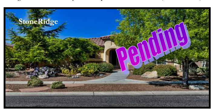
StoneRidge Spanish Newport Plan with Upgrades! Nice Location Near Park! 1381 SqFt., 2BD/+ Den/1.75BA/2Car Garage. Open Concept Granite Kitchen w/Granite Island w/Nice Shaker Style Cabinetry. 1896 N Fire Butte Way, PV $ 239,900.