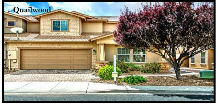
Beautiful & Upgraded Large Quailwood Meadows Townhome with 5BD/3.5BA/2CAR Garage + Great Room + Formal Living/Dining Room + Upstairs Family Room/Loft. 3141 SqFt, Open Granite Kitchen w/Upgraded Appliances. 12651 Bumoso St, Dewey $ 299,000.