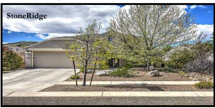
StoneRidge English Mesquite Plan, Lrg 2918 SqFt, 5BD/3.5BA/2GAR. 18" Tiled Entrance Foyer Entry leads to Open Kitchen GreatRoom w/Tiled Cozy Fireplace + 2 Media Niches, Lrg Slider to Private Rear Yard. 1026 Cloud Cliff Pass, PV $ 359,000.