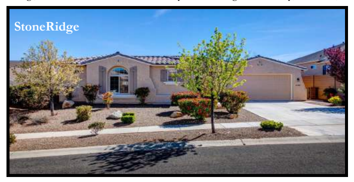
Single Level StoneRidge Summit Plan! 2550 SqFt, 3BD + Bonnu Rm/2.5BA/3Car Garage + Formal Dining/Den. Open Granite Kitchen w/Granite Dining Island, Tiled Informal Dining Area and Double Door Pantry. 7503 E Traders Trail PV $ 400,000.