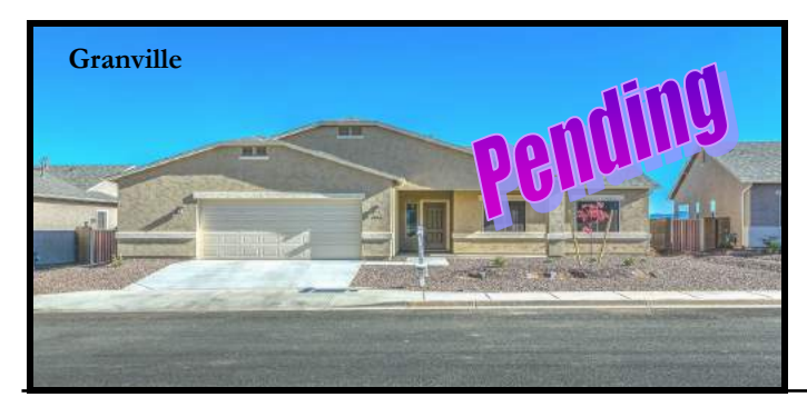
For Lease! Brand New Beautiful Granville Home with Panoramic Views! 3BD/2BA/2.5 Car Garage, 1,661 SqFt. With Spacious Open Great Room and Open Concept Granite Kitchen. 4253 N Pembroke Street, PV $1,650 per mo.