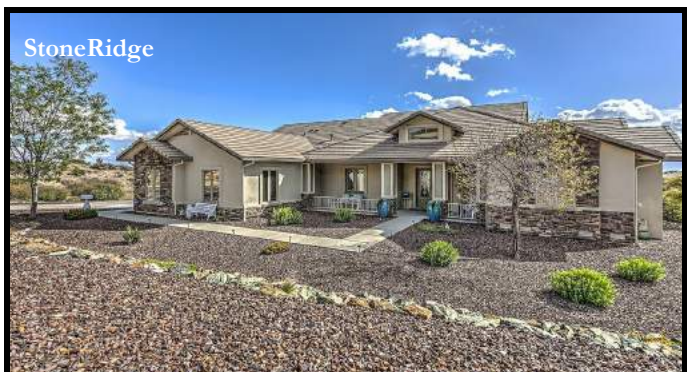
Gorgeous StoneRidge Neil Klein Custom Home with Panoramic Views! 2661 SqFt, 3BD/2.5BA/3GAR, Open Concept Living w/Designer Elegance Throughout! Gourmet Kitchen and Great Room with Great Views! 1515 N Split Rail Trail, PV $ 625,000.