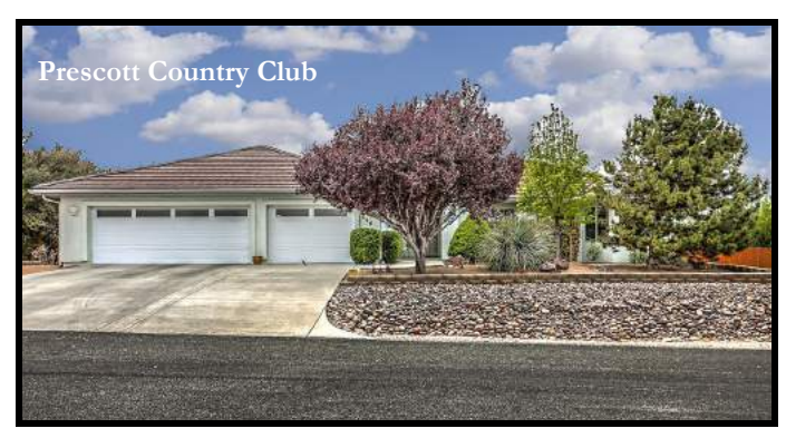
Bright & Spacious Custom Home with Designer Upgrades Throughout! 3,549 SqFt, 4BD/3.5BA/3Car Garage + RV Parking. Open Living Room w/Contemporary Tiled Stone & Granite Cozy Fireplace. Nice Jr Master Suite. 596 N Mohave Trl. PV $ 375,000.