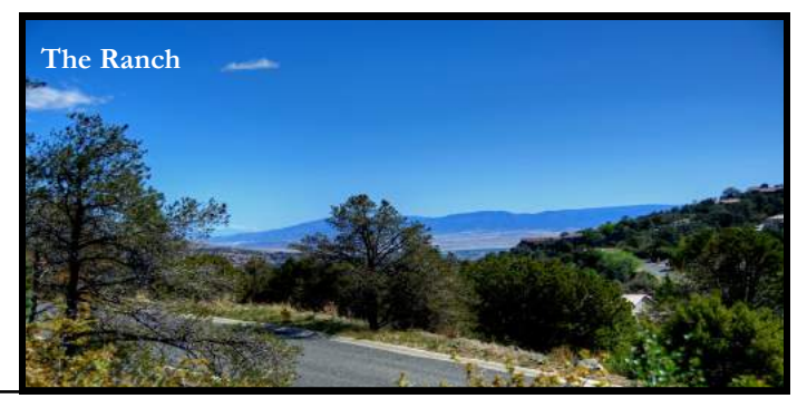
Breathtaking Morning Sunrise, Panoramic Mountain Views, Great Cul-De-Sac Location. Large .53 Acre View Lot inside The Ranch, Prestigious Prescott Location near Shopping and Near Lynx Lake. 548 Lark Haven Circle, Prescott $69,000.