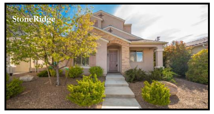
StoneRidge Goldenrod Plan, 1966 SqFt, 4BD/3BA/2GAR, 2 Stories, Sold Furnished, Great 2nd Home w/Nice Upgrades! Spacious Living Rm w/Large Windows & Slider to Rear Yard. Kitchen w/Oak Cabinetry & Recessed Lighting. 7233 E Woolsey Ranch, PV $294,900