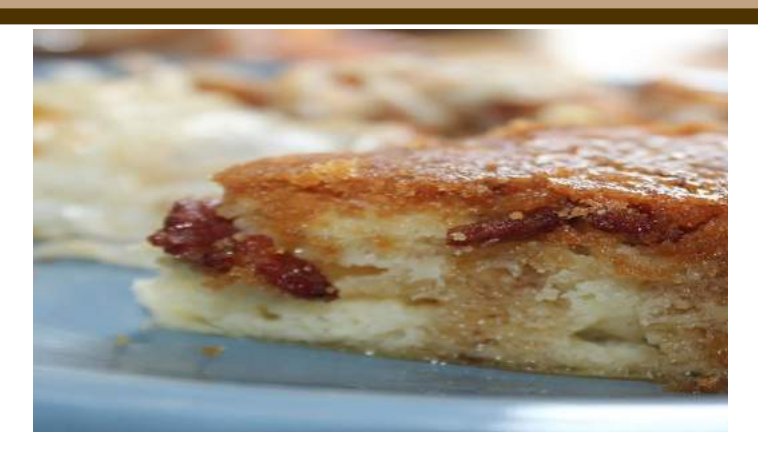
Father's Day Mancake Pancakes