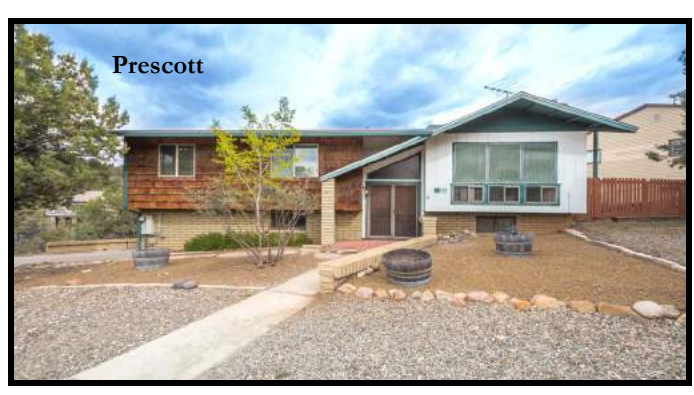
Prescott Evergreen Hills Home w/recent Upgrades! 1846 SqFt, 3BD/2BA/2Car Garage + Great Rm + Family Rm. Private Cul-De-Sac Home w/Mature Trees & Seasonal Creek. Brand New Carpet & Horizontal Blinds. 615 Pauley, Prescott $ 265,000.