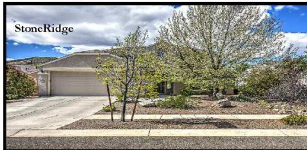
StoneRidge StoneRidge English Mesquite Plan, Lrg 2918 SqFt, 5BD/3.5BA/2GAR. 18" Tiled Entrance Poyer Entry leads to Open Kitchen GreatRoom w/Tiled Cozy Fireplace + 2 Media Niches, Lrg Slider to Private Rear Yard, Oak Cabinetry w/Crown Molding, Corian Counters & Large Island, Dining Room w/Upgraded Bay Window & Lrg Walk-In Pantry. Master BD w/Exec Height Granitex Counter & Surrounds, Dual Sinks, Rainglass Shower, Oval Garden Tub & Lrg Walk-In Closet. 1026 Cloud Cliff Pass, PV $ 359,000.