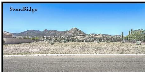
StoneRidge Beautiful Panoramic Views Here! Imagine Your Custom Estate Built Here on this Level .56 Acre Lot. This Street has Custom Homes Only. The Views include Mountains, Boulder Rocks, Canyon and City Lights. 7839 E Bravo Lane, PV $ 135,000.