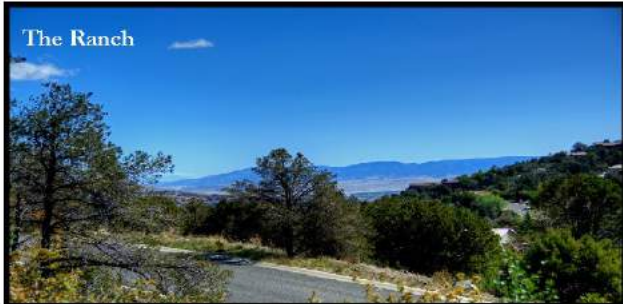
The Ranch Breathtaking Morning Sunrise, Panoramic Mountain Views, Great Cul-De-Sac Location. Large .53 Acre View Lot inside The Ranch, Prestigious Prescott Location near Shopping and Near Lyax Lake. 548 Lark Haven Circle, Prescott $ 69,000.