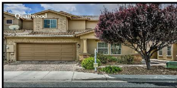
Quailwood Beautiful & Upgraded Large Quailwood Meadows Townhome with 5BD/3.5BA/2CAR Garage + Great Room + Formal Living/Dining Room + Upstairs Family Room/Loft. 3141 SqFt, Open Granite Kitchen w/Upgraded Stainless Appliances + Refrig, Pendant Lighting, Granite Dining Counter, Closet Pantry & Breakfast Nook. Great Room w/ Cozy Tiled Gas Fireplace, Media Niche, Lighted Ceiling Fan, 2 Tone Designer Paint and Light & Bright Windows w/Horizontal Blinds. 12651 Bumoso St, Dewey $ 285,000.