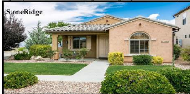
StoneRidge Spanish Ivy Plan on Corner Lot with Mingus Mtn Views! 1206 SqFt, 2BD/2BA/2CAR Garage. Nice Single Story Hm w/Covered Front Porch & Covered Rear Patios w/Views, Green Grass Lawn, Nice Flagstone Extended Patio & Walkway, Block Walls & Drip Watering System. Open Concept Kitchen w/Dining Bar, White Appliances, Laminated Counters, Oak Cabinetry, Closet Pantry, Dining Area & Dining Counter. 1173 N Hobble Strap St., PV $ 225,000