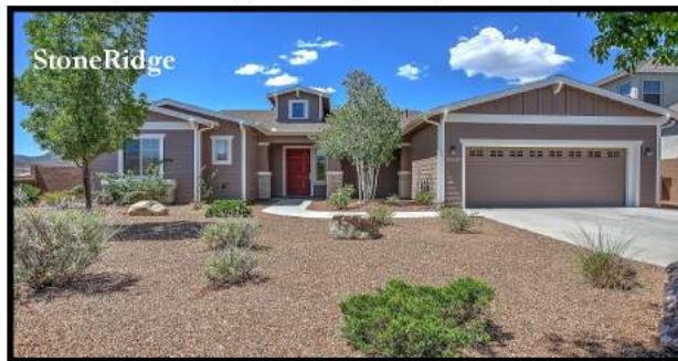
Feels Like Living in a Resort! Panoramic Golf & Mountain Views, Beautiful Private Pool & Spa, Great Area Amenities! StoneRidge Connell Plan w/Upgrades Throughout! 2036 SqFt, 3BD + Double Door Den/2BA/3 Car Garage. Open Granite Kitchen w/Lrg Granite Dining Island, Dining Area with Bay Window, Closet Pantry, S/S Appliances w/Refrig., Double Wall Ovens + Convection. Great Room with Tiled Fireplace, Lighted Ceiling Fan and High Ceilings. 7767 E Bravo Lane, PV $ 430,000.