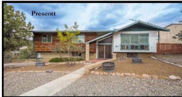
Prescott Prescott Evergreen Hills Home w/ recent Upgrades! 1846 SqFt, 3BD/2BA/2Car Garage + Great Rm + Family Rm. Private Cul-De-Sac Home w/Mature Trees & Seasonal Creek. Brand New Carpet , Brand New Horizontal Window Covers & Newer Interior Paint. Beautiful Stone Floor to Ceiling Great Room Fireplace with Hearth + Light & Bright Wall of Windows. Kitchen w/Brand New Microwave, Wood Laminate Flooring, Laminate Counters, Painted Cabinetry & Lighted Ceiling Fan. 615 Pauley, Prescott $ 265,000.