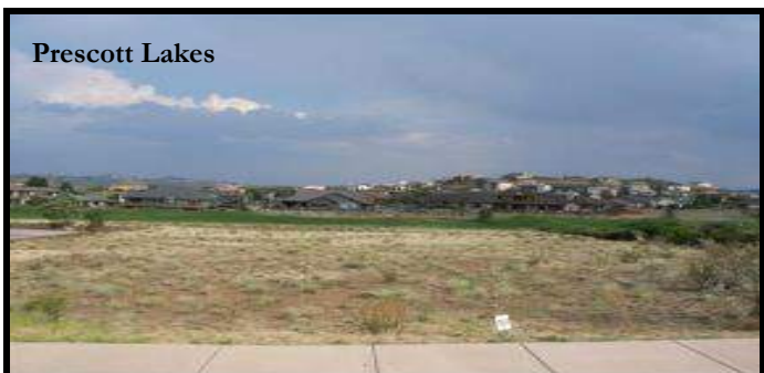
Great Premier Prescott Lakes Golf Course Frontage Location. Location with Fairway & Green Views! This .70 Acre Custom Home or Estate Lot is a Rare Easy Build Flat Lot. Image Your Custom Home Here! 1461 Northridge Drive, Prescott $305,000.