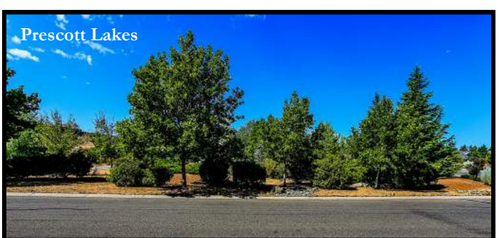
Great Opportunity to Build Your Custom Home in Beautiful Stoney Creek in Prescott Lakes! Easy to Build on Level, Corner Lot w/Gorgeous Trees on the .38 Acres. Superior Lot Value in the low HOA non-gated Stoney Creek Area. 2520 Stoney Creek, Prescott $110,000