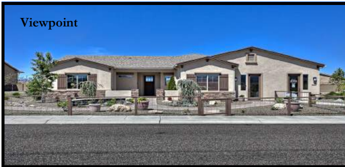
For Lease! Viewpoint, Beautifully Upgraded Move in Ready, Single Level Home. 3BD + Den/Office, 2BA/3GAR, 2103 SqFt. (Previous Dorn Homes Model Home) Lrg Open Concept Granite Kitchen. Avail. January 8270 N Sage Vista, PV 2,000 per mo.