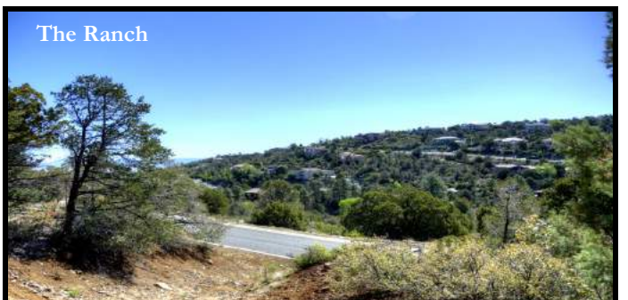
Imagine Your Beautiful Custom Home Here! Breathtaking Morning Sunrise, Panoramic Mountain Views, Great Cul-De-Sac Location. Large .53 Acre View Lot inside The Ranch. Location Near Shopping. 548 Lark Haven Circle, Prescott $59,000.