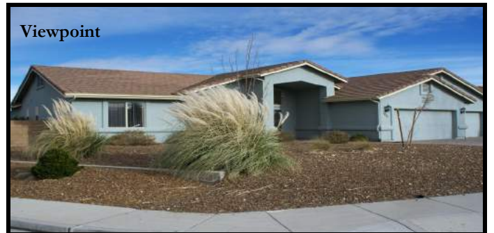
For Lease! Beautiful Large Private Park Ridge Gated Community Home! 2,090 SqFt, 4BR/2BA/3GAR. Gorgeous Upgrades Everywhere! Large Open GreatRoom w/Vaulted Ceilings, Two Sided Tiled Fireplace. 7215 E Park Ridge Dr, PV $1,750 per mo.