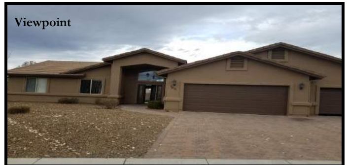
For Lease! Beautiful Large Private Park Ridge Gated Community Home! 2,090 SqFt, 4BR/2BA/3GAR. Gorgeous Upgrades Everywhere! Large Open GreatRoom w/Vaulted Ceilings, Two Sided Tiled Fireplace. 7215 E Park Ridge Dr, PV $1,850 per mo.