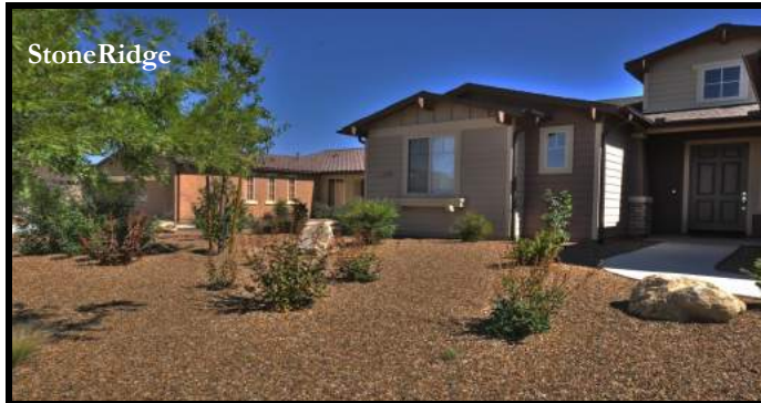
For Lease! StoneRidge Golf Community, Designer Upgrades Throughout! Beautiful View Home. This Looks & Feels Better than a Model Home! 3BD/2BA/2GAR + Bonus Rm, 2078 SqFt. Washer & Dryer Included. 1081 N Half Hitch, PV $1,800 Per Mo.