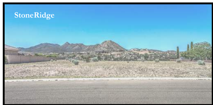
Beautiful Panoramic Mountain Views Here! Imagine Your Custom Estate Built Here on this Level .56 Acre Lot. This Street has Custom Homes Only. The Views include Mountains, Boulders, Canyon & City Lights! 7839 E Bravo Ln, PV $135,000.