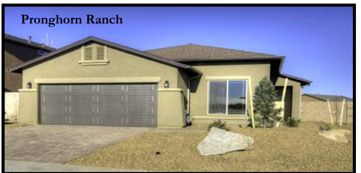
For Lease for 6 Months! Very Nice Corner Location w/Partial Mnt. Views, Single Level, 1,550 SqFt, 3BD/2BA/3Car Garage. Nice Open Kitchen & Granite Island, Stacked Maple Cabinetry + Blk Appliances. 7648 Amber Ridge, PV $1,450 per mo.