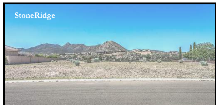
Beautiful Panoramic Mountain Views Here! Imagine Your Custom Estate Built Here on this Level .56 Acre Lot. This Street has Custom Homes Only. The Views include Mountains, Boulders, Canyon & City Lights! 7839 E Bravo Ln, PV $135,000.