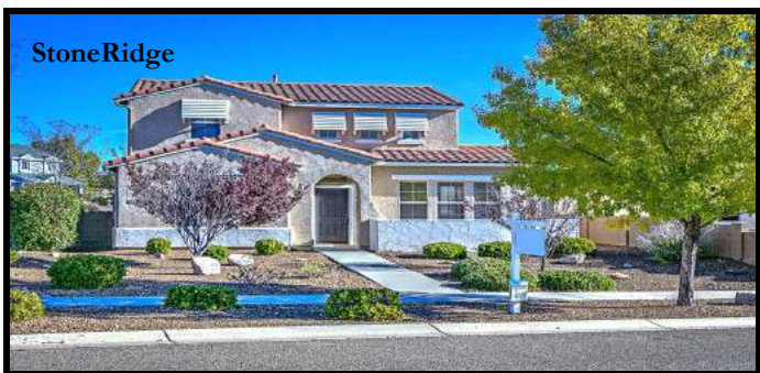
For Lease! Beautiful StoneRidge Golf Community Sierra Plan for Lease! 2,153 SqFt, 4BD/3BA/2Car Garage, 2 Stories, Nice Corner Location. Available for Move In Now! Large Great Rm w/3 Sided Fireplace. 7782 E Bravo Lane, PV $1,700 per mo.