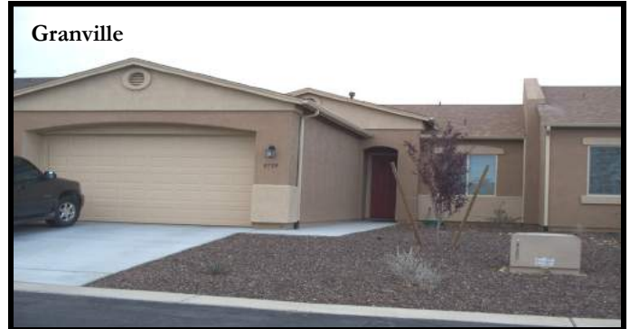
For Lease! New Granville Arbor Home with Views! 1,384 SqFt, 3BD/2BA/2Car Garage. Single Level Home w/Granite Open Concept Kitchen/GreatRoom, Dining Counter, Closet Pantry and Black Upgraded Appliances. 6739 E Hetley Pl, PV $1,450 per mo.