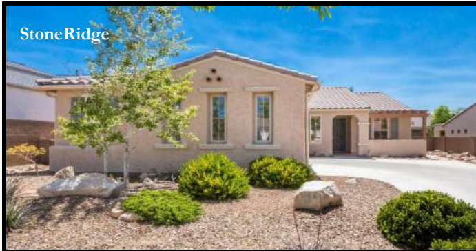
For Lease! Beautiful StoneRidge Golf Community Chaparral Plan, 2BD + Double Door Den/2BA/3Car Garage, 2090 SqFt, Single Story. Designer Upgrades Throughout! Nice Open Concept Kitchen w/Corian Counters. 7333 E Goodnight Lane, PV $1,600 per mo.