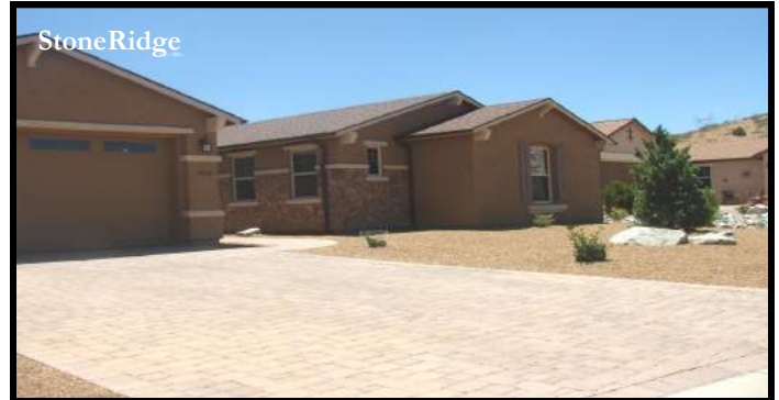
For Lease! Gorgeous StoneRidge Cypress Plan with Breathtaking Panoramic Mountain & Valley Views! 2,540 SqFt, 3BD/2.5BA/3+GAR + Bonus Room. Gourmet Granite Kitchen w/Mahogany Stacked Cabinetry. 1036 N Wide Open Trl, PV $2,000 per mo.