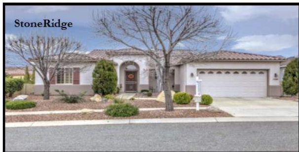
Amazing StoneRidge Connell Plan w/ Panoramic Mountain Views! Completely Upgraded Throughout! 3BD + Bonus Rm/3BA/3Car Garage + Great Room + AZ Rm., 2137 SqFt. Open Concept Kitchen w/ Granite Counters. 7285 Cozy Camp, PV $ 439,900.