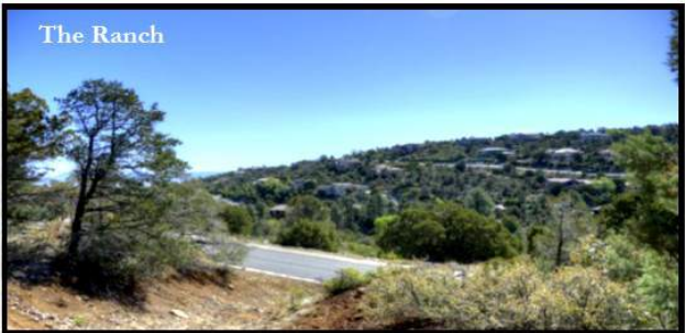
Imagine Your Beautiful Custom Home Here! Breathtaking Morning Sunrise, Panoramic Mountain Views, Great Cul-De-Sac Location. Large .53 Acre View Lot inside The Ranch. Location Near Shopping. 548 Lark Haven Circle, Prescott $ 59,000.