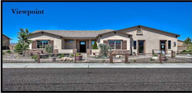
For Lease! Viewpoint, Beautifully Upgraded Move in Ready, Single Level Home. 3BD + Den/Office, 2BA/3GAR, 2103 SqFt. (Previous Dorn Homes Model Home) Lrg Open Concept Granite Kitchen. Avail. January 8270 N Sage Vista, PV 2,000 per mo.