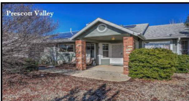
Highly Desired Prescott Valley Unit 20 Single Level Home w/ Plenty of RV Parking! 3BD/2BA/2GAR, 1699 SqFt, Big & Beautiful Living Rm w/ Gorgeous Floor to Ceiling Stacked Stone Cozy Fireplace w/ Flagstone Hearth. 9040 E Big Horn, PV $ 269,000.