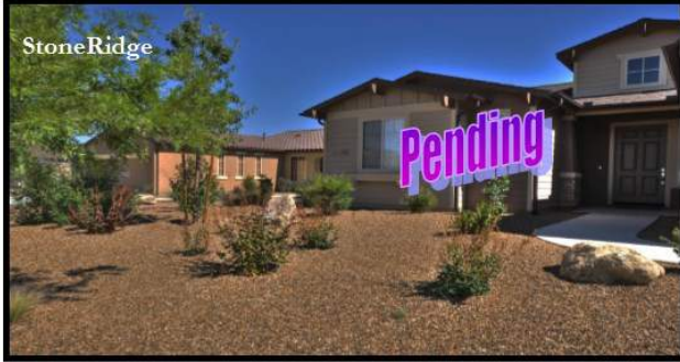
For Lease! StoneRidge Golf Community, Designer Upgrades Throughout! Beautiful View Home. This Looks & Feels Better than a Model Home! 3BD/2BA/2GAR + Bonus Rm, 2078 SqFt. Washer & Dryer Included. 1081 N Half Hitch, PV $1,800 Per Mo.