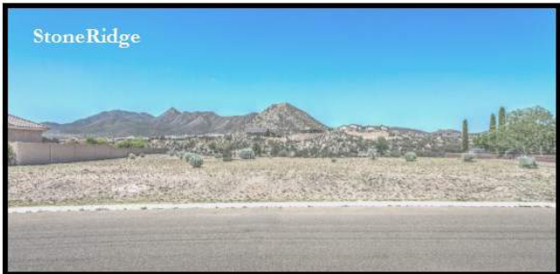
Beautiful Panoramic Mountain Views Here! Imagine Your Custom Estate Built Here on this Level .56 Acre Lot. This Street has Custom Homes Only. The Views include Mountains, Boulders, Canyon & City Lights! 7839 E Bravo Ln, PV $135,000.