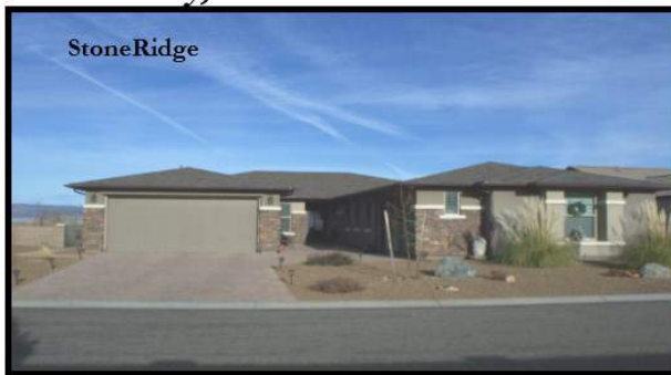
StoneRidge Dream Home w/ Breathtaking Panoramic Mingus Mnt Views! Gorgeous Designer Upgraded Cypress Plan, Better than a Model Home! Spacious Single Level, 2519 SqFt, 3BD/2.5BA/4Car Garage. 1169 N Stack Rock Road, PV $ 579,375

February, 2017 Beautiful Homes & Custom Lots For Sale and For Lease!