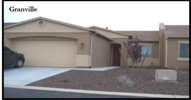
For Lease! New Granville Arbor Home with Views! 1,384 SqFt, 3BD/2BA/2Car Garage. Single Level Home w/ Granite Open Concept Kitchen/ GreatRoom, Dining Counter, Closet Pantry and Black Upgraded Appliances. 6739 E Hedley Pl, PV $1,450 per mo.