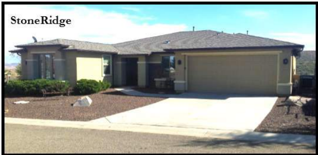
For Lease! StoneRidge Sage Plan Beauty! Upgraded w/ Panoramic Mnt. Views! 2118 SqFt, Single Level Home, 3BD + Den/2.5BA/3Car Tandem Garage. Gorgeous Granite Kitchen w/ Granite Counters and Island. 1000 Wide Open Trail, PV $1,900 per mo.