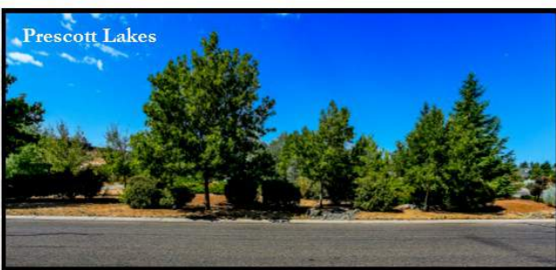
Great Opportunity to Build Your Custom Home in Beautiful Stoney Creek in Prescott Lakes! Easy to Build on Level, Corner Lot w/ Gorgeous Trees on the .38 Acres. Superior Lot Value in the low HOA non-gated Stoney Creek Area. 2520 Stoney Creek, Prescott $ 87,000