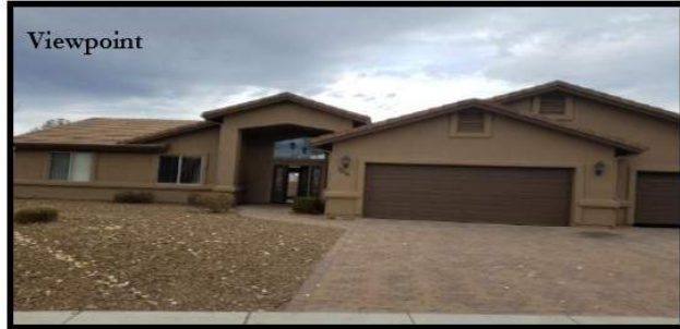
For Lease! Beautiful Large Private Park Ridge Gated Community Home! 2,090 SqFt, 4BR/2BA/3GAR. Gorgeous Upgrades Everywhere! Large Open GreatRoom w/ Vaulted Ceilings, Two Sided Tiled Fireplace. 7215 E Park Ridge Dr, PV $1,850 per mo.