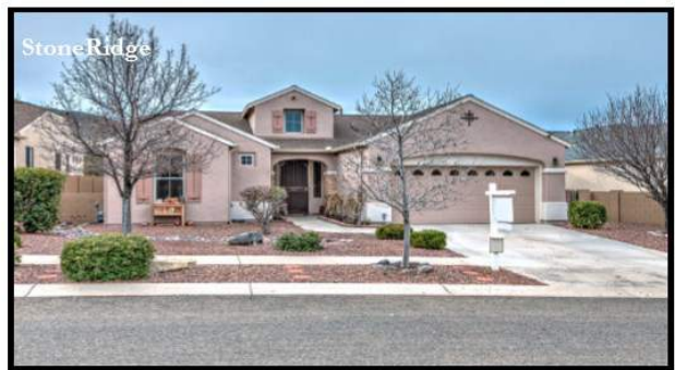
Highly Desired StoneRidge English Lupine Plan w/ Upgrades, located near the Community Park & Clubhouse. Well Cared for Single Level Home w/ 2,123 SqFt, 3BD/2BA/2+GAR. Open Concept Floor Plan! 7315 E Night Watch Way, PV $ 373,000.