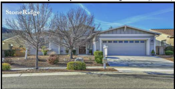
Charming StoneRidge Bungalow Lupine Plan with Upgrades Throughout! Single Level, 2070 SqFt, 3BD + Bonus Rm/2BA/ Car Garage. Nice Open Concept Kitchen w/ Granite Counters. Cozy Tiled F/P in Great Room. 7177 Barefoot Lane, PV $ 373,000.