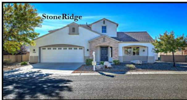
Beautiful Panoramic Bradshaw Mountain Views from this Gorgeous StoneRidge Granite Plan, 5BD + Bonus Rm/3BA/2 Car Garage + Formal Living Rm + Great Rm + Loft, 3487 Sq Ft with Open Concept Kitchen. 7651E Bravo Lane, PV $ 475,000.