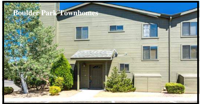
Boulder Park Townhomes Boulder Park Townhome! Move In Ready & Recently Upgraded! Brand New Interior Paint, Brand New Carpet, Brand New S/S Appliances + New S/S Refrigerator. GreatRoom w/Cozy Tiled Fireplace. 1113 Virgil Street, Prescott $199,000.