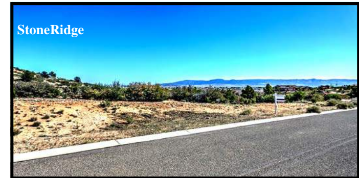
StoneRidge Beautiful Mingus Mountain Views Here from this Nice StoneRidge Custom Homes only Street. Very Quite area of StoneRidge with Surrounding Mountain & Golf Views! Nice .51 Acre Lot Location. 6360 Slow Cattle Dr. $145,000.