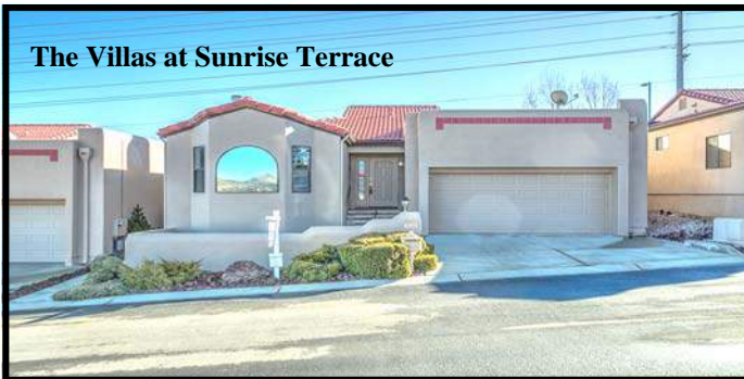
The Villas at Sunrise Terrace For Lease! Very Nice & Clean Home w/Beautiful Granite Mountain Views! 1518 SqFt. 2BD + Formal Dining Rm or Den/2BA/2Car Garage, Available Now! Open Living Room w/Cozy Tiled Fireplace. 2648 College Heights Rd., Prescott $1,600 per Month.