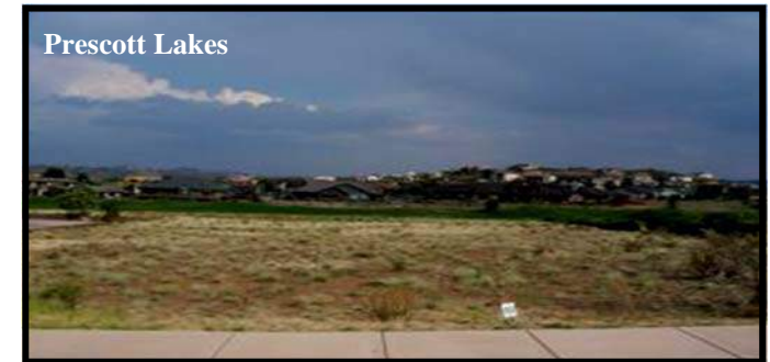
Prescott Lakes Great Premier Prescott Lakes Golf Course Frontage Location with Fairway & Green Views! Imagine Your Custom Home Here in the Gated Prescott Lakes "Estates" Golf Community. Site Built Homes Only. 1461 Northridge Drive,