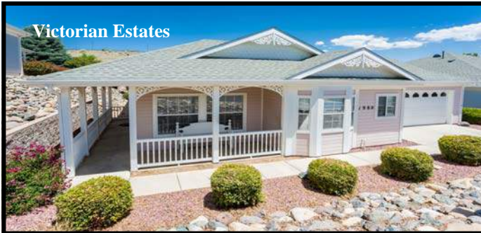
Victorian Estates Move In Ready Victorian Estates Duchess Plan, 1660 SqFt, 2BD + Double Door Den, 2BA/2 Car Garage + Workshop Area. Well Kept, Single Level Home in Really Nice Gated 55+ Community. 1980 E Regent, PV $285,000.