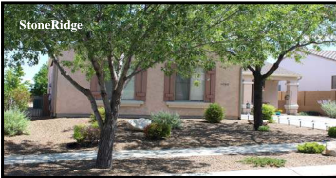
StoneRidge StoneRidge Golf Community English Chaparral Plan with Beautiful Upgrades Throughout! Single Level, 1864 SqFt, 3BD/2BA/2Car Garage. Nice GreatRoom with Cozy Tiled Fireplace and High Ceilings. 7312 E Goodnight Lane, PV $325,000.