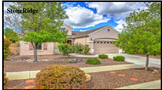
Gardeners Dream StoneRidge English Lupine Plan with Upgrades Throughout! Nice Rose Garden Entry w/Stacked Stone Porch, Single Level Home w/2,123 SqFt, 3BD/2BA/2+GAR. Open Concept Floor Plan! 7315 E Night Watch Way, PV $ 369,000.