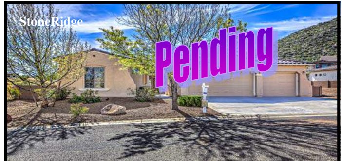
StoneRidge For Lease! Mountain View Cul-de-Sac Location, StoneRidge Spanish Buckhorn Plan. Nice Single Level, 2779 SqFt, 3BD/2.5BA/3Car Garage + GreatRoom + Formal Dining Rm + Family Rm + Office/Den. 7453 E Beaver Valley Rd., PV $2,200 per Month.