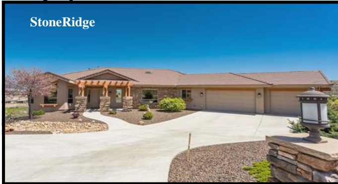
Amazing StoneRidge Golf Community Custom "Crystal Creek" Estate View Home. Breathtaking Panoramic Golf, Mountain and City Lights Views. 4465 Sq Ft, 5BD/3.5BA 3Car Garage + GreatRoom + Family Rm + Wine Rm. 1403 Split Rail Trl, PV $ 700,000.

July, 2017 Beautiful Homes & Custom Lots For Sale and For Lease!