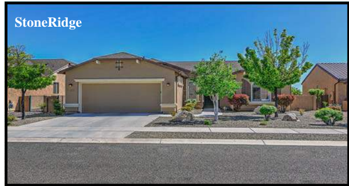
Rare StoneRidge Tamarisk Plan with Upgrades Throughout! Move In Today! Nice Single Level, 2190 SqFt, 3BD/2.5BA/2Car Garage, 2 Full Master Suites + 1 Jr Suite. Open Concept Kitchen w/Designer Beechwood Cabinetry. 1231 Lucky Draw, PV $