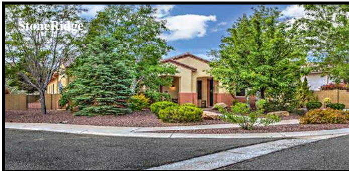
Serene StoneRidge Spanish Bradshaw Plan with Panoramic Bradshaw Mountain Views! Amazing Flexible Floor plan w/2641 SqFt, Single Level Home with Private Entrance Guest Casita. Nice Upgrades Throughout! 7297 E Cozy Camp Dr., PV $ 415,000.