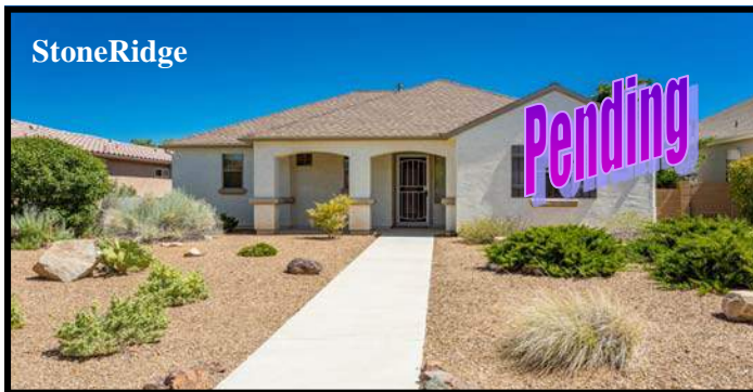
Cute StoneRidge Gold community "Newport" Plan, 3BD/2BA/2Car Garage, Single Level, 1365 SqFt. Open Layout with ALL Tile Floors, Open Kitchen w/Oak Cabinetry, Track Lighting, Laminate Counters & Island. 7925 E Crooked Creek Trl., PV $