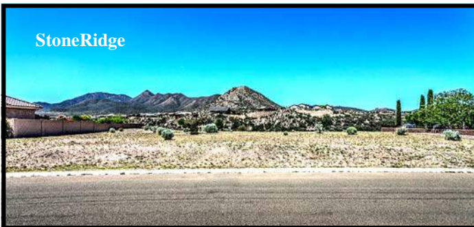
StoneRidge Beautiful Panoramic Mountain Views Here! Imagine Your Custom Estate Built Here on this Level .56 Acre Lot. This Street has Custom Homes Only. The Views include Mountains, Boulders, Canyon & City Lights! 7839 E Bravo Ln, PV $