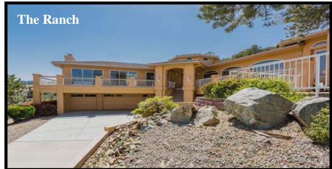
Custom Home, Breathtaking Views in Prime Location! A "Distinctive Homes" Build with Grand Curb Appeal. Tower Foyer, Cathedral Ceilings, Dual French Doors, Arch Glass, Large GreatRoom w/Surround Sound. 3151 Rainbow Ridge, Prescott $