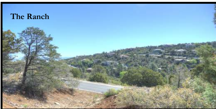
Imagine Your Beautiful Custom Home Here! Breathtaking Morning Sunrise, Panoramic Mountain Views, Great Cul-De-Sac Location. Large .53 Acre View Lot inside The Ranch. Close to Town and Shopping. 548 Lark Haven Circle, Prescott $ 59,000.