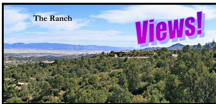
Beautiful Custom Home 1.17 Acre VIEW Lot in THE RANCH AT PRESCOTT! Owner is Motivated! Gorgeous Lot in the Upper Portion of the Ranch, Panoramic Mingus Mountains, San Francisco Peaks, Valley, City Lights & backs up to State Land. 665 Lee Blvd, Prescott $175,000.