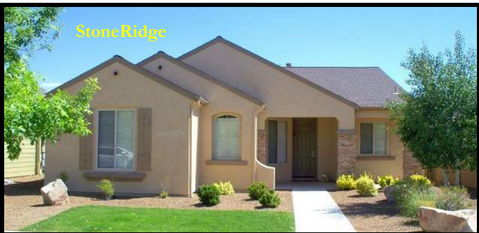
For Lease! StoneRidge Sonoma w/3BD + Den, 2BA/2GAR, 1696 SqFt. Kitchen w/Granite Counters, S/S Appliances + Refrig, Maple Cabinetry, Pull Out Drawers & Under Counter Lighting. GreatRoom w/20" Tile Flooring. 1031 N Cloud Cliff Pass, PV $1700 per month