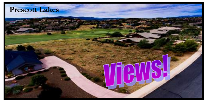
Great Premier Prescott Lakes Golf Course Frontage Location with Fairway & Green Views! Imagine Your Custom Home Here in the Gated Prescott Lakes "Estates" Golf Community. Site Built Homes Only. 1461 Northridge Drive, Prescott $250,000.