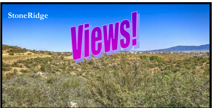
StoneRidge Custom Home Vacant Lot on Highly Desired Custom Homes Only Street. Nice .57 Acre Lot near Cul-de-sac w/Great Views of the Mingus Mountains, City Lights & Valley Views + Beautiful Unique Boulders. 6448 E. Slow Cattle, PV $119,000.