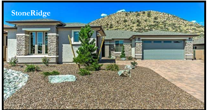
For Lease! StoneRidge Completely Upgraded View Home. Beautiful English Sage Plan, 2190 SqFt, 3BD + Double Door Den or Office/2.5BA/4Car Garage. Large Open Gourmet Granite Kitchen w/Espresso Color Cabinetry, Large Island, S/S Appliances, 1062 Wide Open, PV $2000. per month