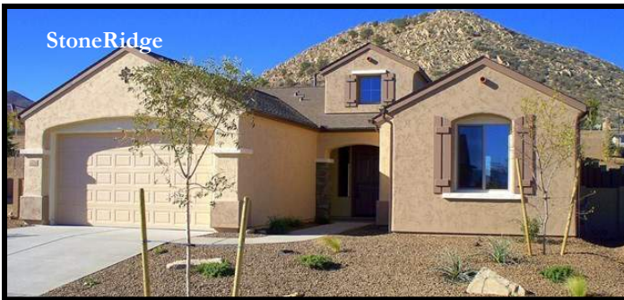
For Lease! StoneRidge Lupine Plan! 4BD/3BA/2+GAR, 2080 SqFt, Open Kitchen w/Dining Island, Bay Window, Pantry, Corian Counters, Stacked Cherry Cabinetry, S/S Appliances + Refrig. Formal Dining Area & Great Room w/Ceiling Fan. 1222 Rusty Nail, PV $ 1850 Per month