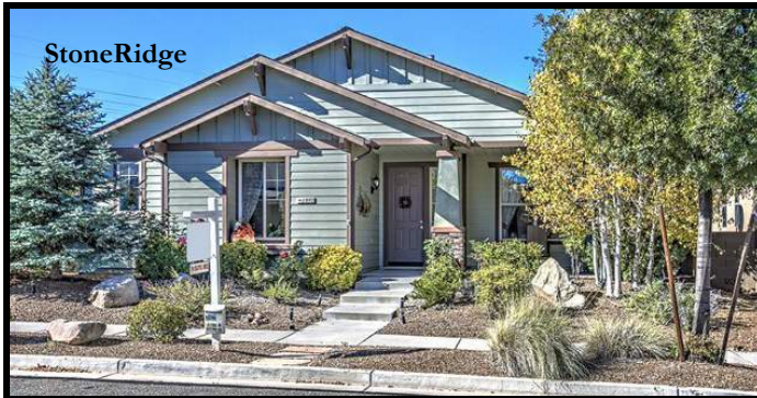
StoneRidge Laguna Plan, 1864 SqFt, 3BD/2BA/2 Car Garage. Kitchen w/Granite Counters & Dining Island, Designer Cabinetry w/Drawer Pullouts, S/S Appliances + Blk Refrig, Gas Stove, Large Pantry & Vaulted Ceilings. 1092 N Hobble Strap, PV $ 350,000.