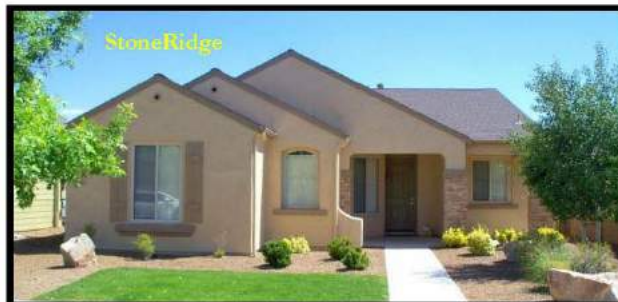
For Lease! StoneRidge Sonoma w/3BD + Den, 2BA/2GAR, 1696 SqFt. Kitchen w/Granite Counters, S/S Appliances + Refrig, Maple Cabinetry, Pull Out Drawers & Under Counter Lighting, Great Room w/20" Tile Flooring. 1031 N Cloud Cliff Pass, PV $1700 per month.