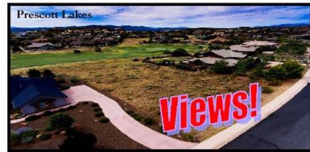
Great Premier Prescott Lakes Golf Course Frontage Location with Fairway & Green Views! Imagine Your Custom Home Here in the Gated Prescott Lakes "Estates" Golf Community. Site Built Homes Only. 1461 Northridge Drive, Prescott $250,000.