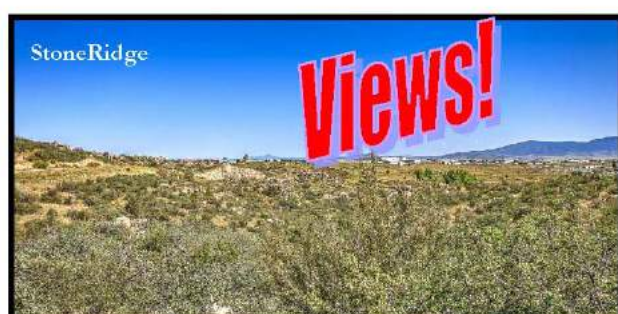
StoneRidge Custom Home Vacant Lot on Highly Desired Custom Homes Only Street. Nice .57 Acre Lot near Cul-de-sac w/Great Views of the Mingus Mountains, City Lights & Valley Views + Beautiful Unique Boulders. 6448 E. Slow Cattle, PV $119,000.