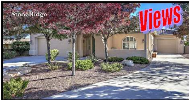
StoneRidge Customized Home w/MingusView! Spacious 3407 SqFt, 5BD/3BA/2 Attached Garages (3+Cars), Open Concept Kitchen Perfect for Entertaining w/Granite Counter Tops, Upgraded Cabinetry, Jenn Air S/S Appliances + Refrig, Miele Dishwasher. 7638 Traders Trail, PV $ 525,000.