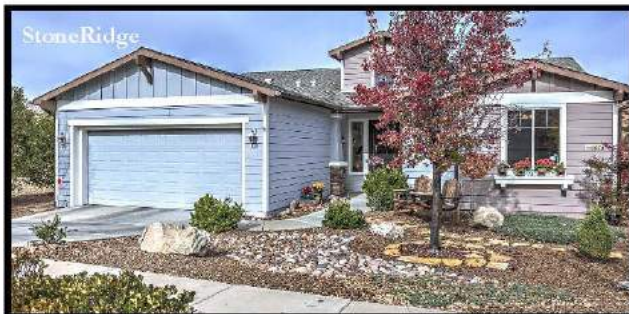
Unique Location Lupine w/Privacy & Mtn Views! 2086 SqFt, 3BD/2BA/2GAR+ Hot Tub. Kitchen w/Blk Corian Counters & Island, Cherrywood Cabinetry, S/S Appliances + Refrig, Under-counter & Recessed Lighting, Cabinet Pullouts & Reverse Osmosis. 6670 Goodnight Ln, PV $385,000.