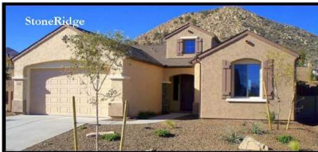
For Lease! StoneRidge Lupine Plan! 4BD/3BA/2+GAR, 2080 SqFt, Open Kitchen w/Dining Island, Bay Window, Pantry, Corian Counters, Stacked Cherry Cabinetry, S/S Appliances + Refrig, Formal Dining Area & Great Room w/Ceiling Fan. 1222 Rusty Nail, PV $ 1850 Per month.