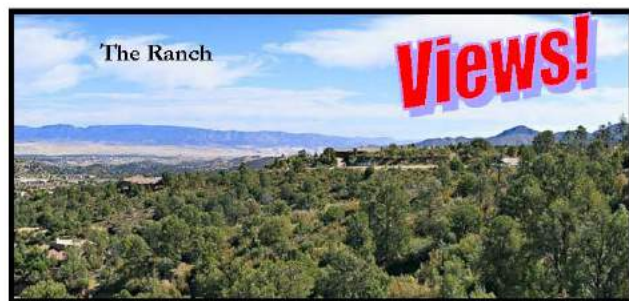
Beautiful Custom Home 1.17 Acre VIEW Lot in THE RANCH AT PRESCOTT! Owner is Motivated! Gorgeous Lot in the Upper Portion of the Ranch, Panoramic Mingus Mountains, San Francisco Peaks, Valley, City Lights & backs up to State Land. 665 Lee Blvd, Prescott $1,150,000.