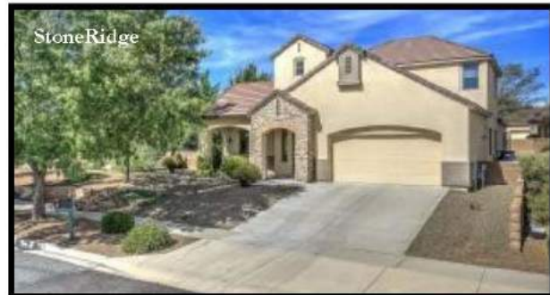
Corner Location w/Privacy Yard & Mingus Mountain View! Upgraded 5BD/2.75BA/2+GAR, 3560 SqFt, Spacious Open Kitchen w/Upgraded Carrara Marble Counters & Center Island, S/S Appliances, Tumbled Tile Backsplash, Serene Beautiful Yards! 1860 Bluff Top Drive, PV $525,000.