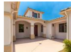
7409 E Weaver Way 2503 sq. ft. $407,500