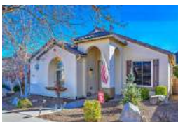
1301 N Kettle Hill Road 1853 sq. ft. $355,000