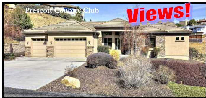
Prescott Country Club

Acacia Plan w/Panoramic Mingus Mtn Views! Granite Counters, New Roof, Glass Pantry Door, White Appliances w/Double Oven + Refrig, Upgraded Lighting, Cabinet Slide-outs, 20" Diagonal Tile GreatRoom w/Cozy Fireplace. 1915 N Bittersweet Wy, PV $450,000.