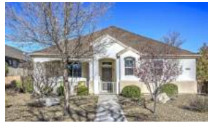
7912 E Crimsonfire Road 1536 sq. ft. $295,000