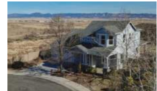
7983 E Crooked Trail 2182 sq. ft. $317,500