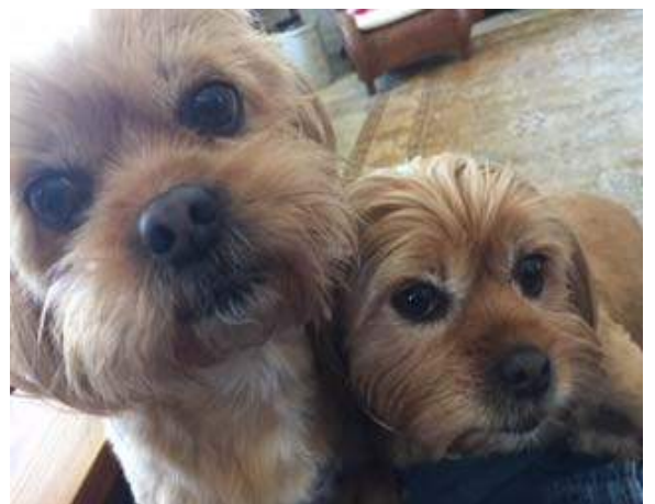
Shuggie & Bouvi Nagy

If you are interested in forming a resident driven group to facilitate more Bingo please email or text Erica Crowley at cealvarado2003@yahoo.com (text) 949-322-0079