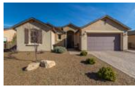
1123 N Lucky Draw Drive 1749 sq. ft. $370,000