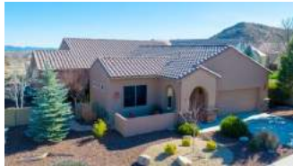
7333 E Cozy Camp Drive 2779 sq. ft. $515,000