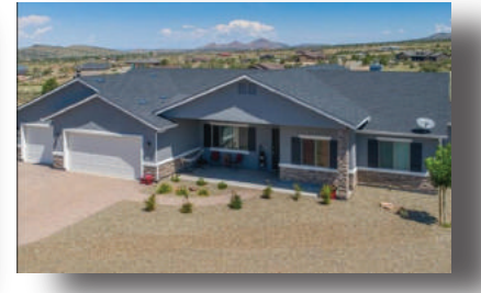
9485 Snapdragon Dr Legend Hills, Prescott Valley $550,000 MLS#1014121