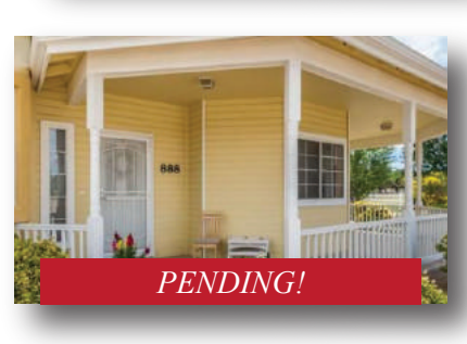
888 Tiffany Place Chino Valley $419,000 MLS#1012247