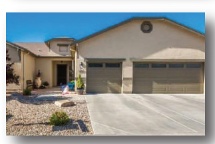
6368 Jaden Lane Granville $425,000 MLS#1012653