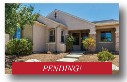
1366 Goose Flat Way Stoneridge $360,000 MLS#1013555