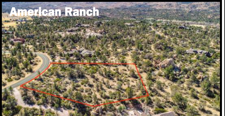
September 2018 Beautiful Homes & Custom Lots For Sale and For Lease!

Gorgeous American Ranch Premium Custom Home Lot! Big 1.19 Acre of Gentle Slope, Amazing Unique Boulder Outcroppings, Beautiful Granite Mountain Views, Nice Quiet Treed Location on Cul-De-Sac Street, Good Build Site in Exclusive American Ranch. Build your Custom Dream Home Here!