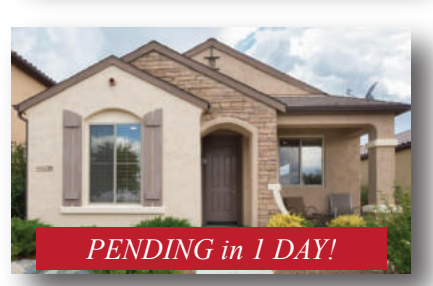
1138 Fence Post Place Stoneridge $290,000 MLS#1014406