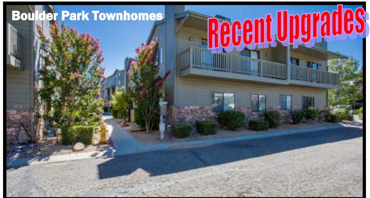
Boulder Park Townhomes

Gorgeous American Ranch Premium Custom Home Lot! Big 1.19 Acre of Gentle Slope, Amazing Unique Boulder Outcroppings, Beautiful Granite Mountain Views, Nice Quiet Treed Location on Cul-De-Sac Street, Good Build Site in Exclusive American Ranch. Build your Custom Dream Home Here! 9850 Clear Fork, Prescott AZ 86305 $ 125,000.