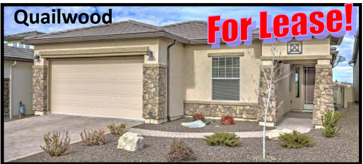
1956 SqFt, 3BD + Big Bonus Room/2Ba/2Car Garage. Paver Driveway & Covered Paver Front Porch w/Front Door Security Screen. Tiled Entry Foyer, Big Double Door Den/Bonus Room (Possible 4th Bedroom Without Closet) w/Carpet Flooring, Sunny Windows with Pleated Shades & Lighted Ceiling Fan. Family Rm w/Carpet Flooring, Media Niche, Lighted Ceiling Fan & Sunny Windows w/Pleated Shades. Kitchen has Oak Cabinetry, Double Door Pantry, Laminate Counters & Island, Black Appliances + Refrig & Tile Flooring. Spacious Master w/Tub/Shower Combo, Dual Sinks, Linen & Walk-In Closets. 12874 E Delgado St, Dewey AZ $1695 Per Month

New Home! 4BD/3BA/Deep 2+ Car Garage, 2181 SqFt. Granite Kitchen w/Granite Island & Dining Counters, Hardwood Cabinetry, Tiled Dining Area w/Window & French Door to Rear Yard Patio, Stainless Appliances + Gas Stove, Stainless Undermount Sink & Pullout Sprayer Faucet, Open to Spacious Tiled Great Room with Sunny Window & Ceiling Fan Outlet. Master Suite w/Carpet Flooring, Ceiling Fan Outlet, 2 Tone Paint, Granite executive Height Vanity Counter w/Dual Sinks, Chrome Fixtures & Faucets, Hardwood Cabinetry, Clear Glass Tiled Step-In Shower w/Rubbed Oil Bronze Frame, Private Toilet Rm, Linen & Walk-In Closets. 3 Guest Bedrooms w/Carpet Flooring, Sunny Windows & Ceiling Fan Outlets. 8132 Ancient Trail, PV $309,900