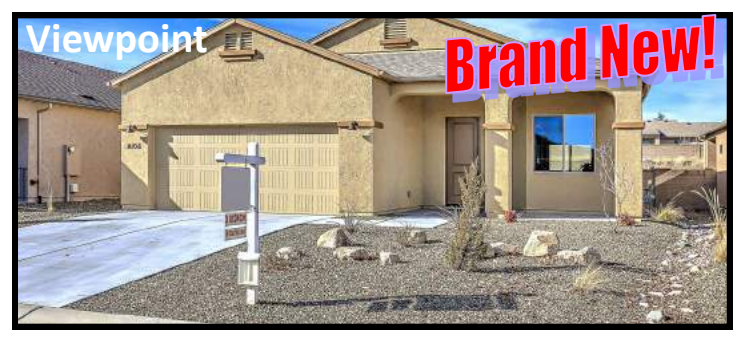
1645 SqFt, 3BD/2BA/2Car Garage, Gorgeous Open Kitchen w/Granite Counter, Stainless Appliances + Gas Stove, Staggered Cabinetry, Pantry Cabinets, Stainless Under-mount Sink w/Pullout Sprayer, Tile Flooring, Dining Nook + Dining Rm. Sunny Tiled Great Room w/Accent Windows, Tall Ceilings & Sliding Door to Rear Covered Patio. Master Suite w/Clear Glass Step in Tiled Shower, Tall Executive Height Granite Vanity w/Dual Sinks, Private Toilet Rm, Linen & Lrg Walk-in Closets. Laundry Rm w/Direct Garage Access, Cabinetry w/Folding Counter, Gas & Elec Hookups. Deep 2 Car Garage w/Workshop Area, 40 Gallon W/H w/Hot Water Re-circulation Pump. 8108 N Ancient Trail, PV $289,900.