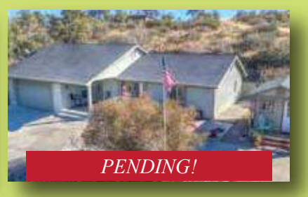
1661 N Lapis Dr Prescott $275,000 MLS#1017458

7939 E Las Flores Ave Prescott Valley $249,900 MLS#1018552