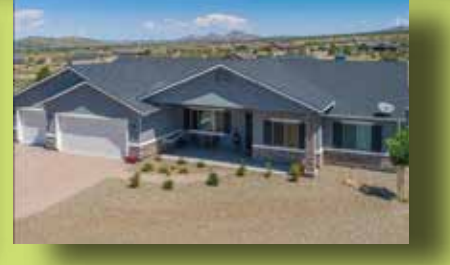
9485 Snapdragon Dr Legend Hills, Prescott Valley $519,900 MLS#1014121

2005 Meadowridge Rd Prescott $559,000 MLS#1018397